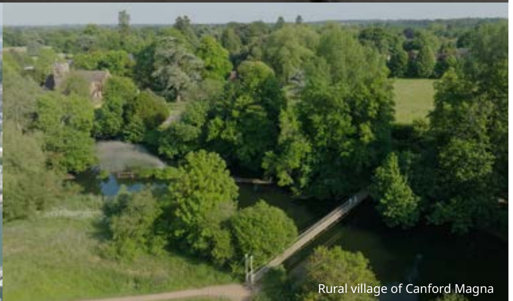
Rural village of Canford Magna