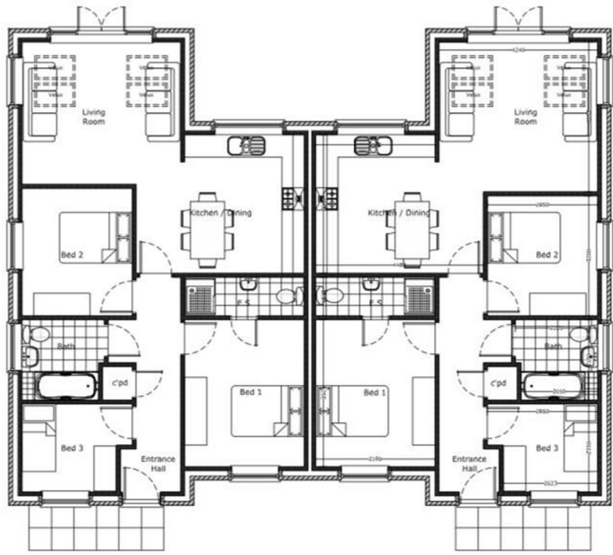
Proposed Floor Plans Gross Floor Area = 81.7m 2 or 879ft 2

This drawing has been prepared for the purpose of obtaining Planning and/or Building Regulation Approval only. The contractor is responsible for taking and checking all dimensions and levels on site prior to commencement and reporting back any discrepancies to the client and the architect immediately. All materials specified on this drawing are to be used in strict accordance with manufacturer's written instructions and current codes of practice. Variations to the specifications within these drawings or associated documents are at the contractor's own risk. This drawing is the copyright of DesignQube by Steven Brown Ltd and must not be reproduced without written consent. © DesignQube by Steven Brown 2022