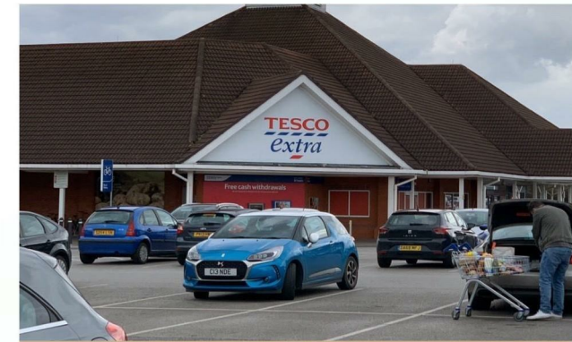
Tesco superstore - 4.4 miles