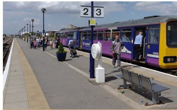
Train Station - 6.6 miles