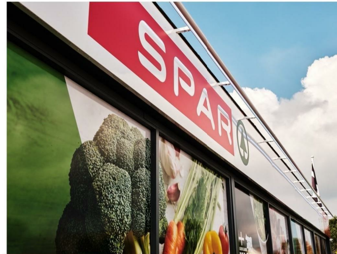
Corner shop & post office