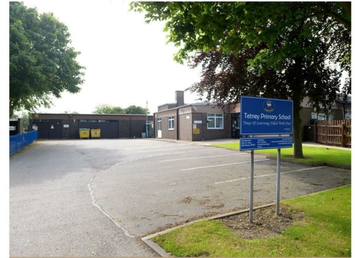
Tetney Primary School