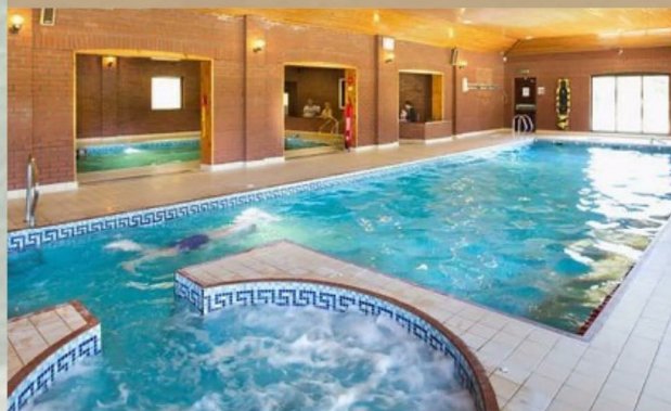
Bannatyne Health Club & Spa - 3.3 miles