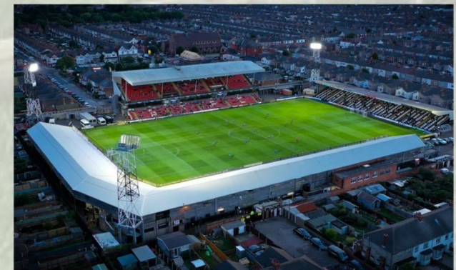
Blundell Park - 7.4 miles