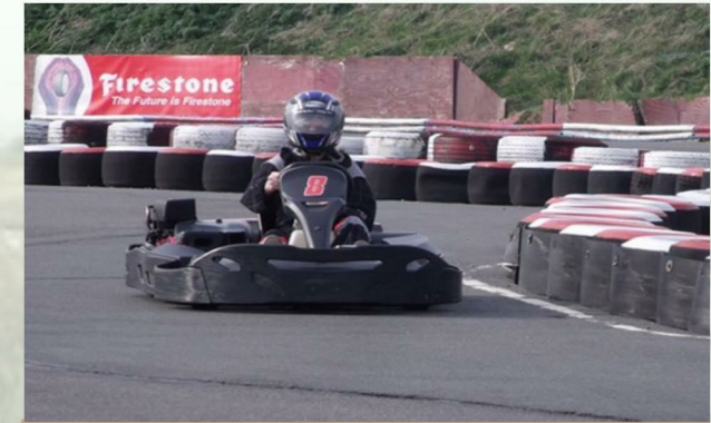
Chequered Flag Karting - 2.4 miles