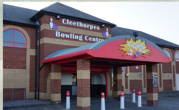
Ten Pin Bowling - 5.9 miles