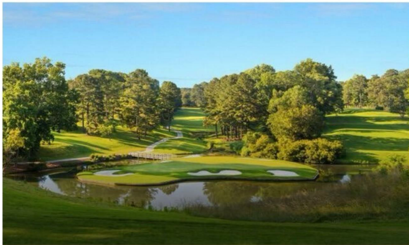
Tetney Golf Course