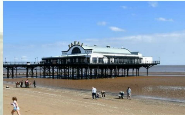
Cleethorpes beach - 6.4 miles