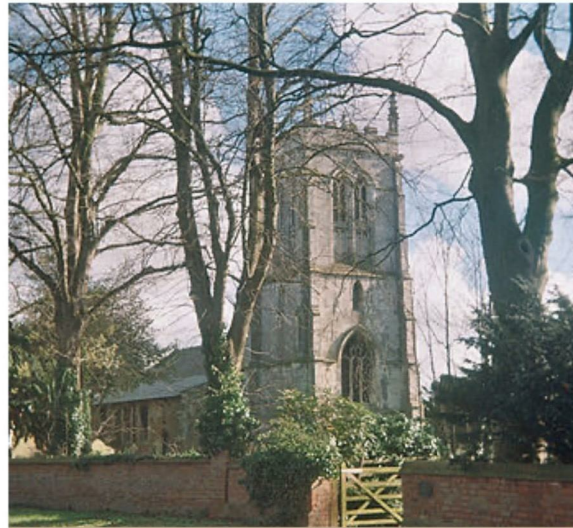
The Parish Church