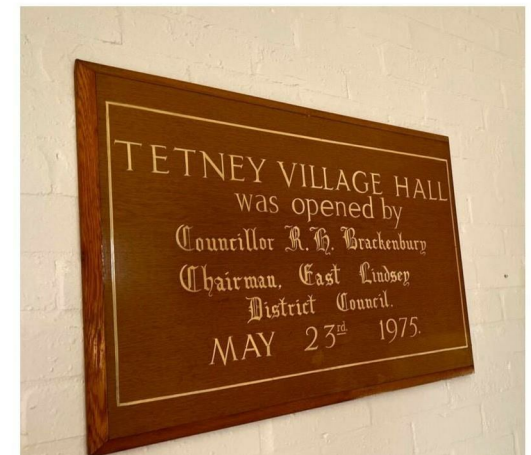
Tetney Village Hall