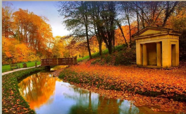
Hubbards Hills - 12.8 miles