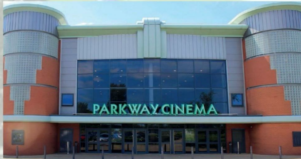
Cleethorpes Cinema - 5.9 miles