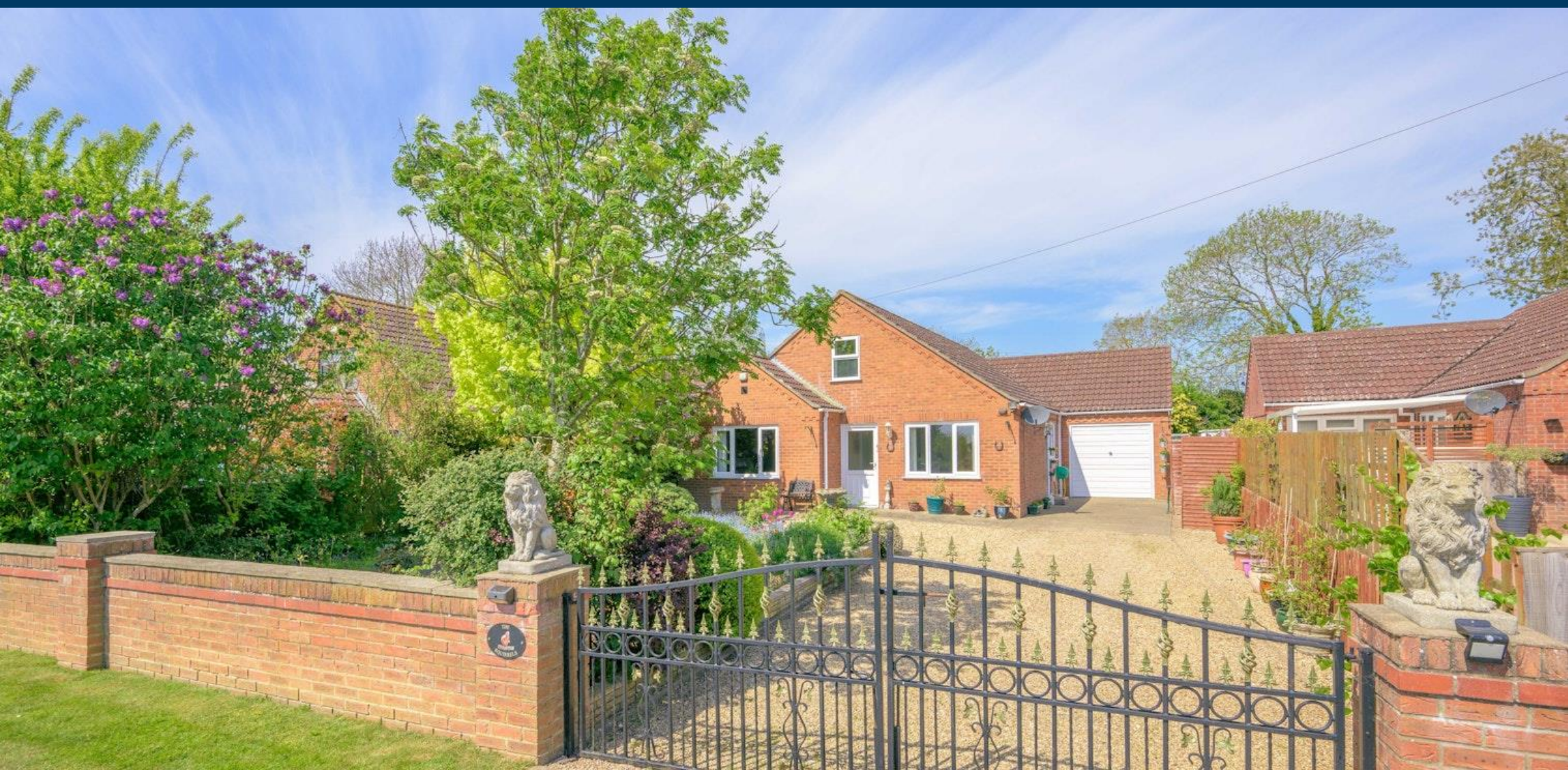
The Squirrels, Station Road, Thorpe St Peter, PE24 4NN