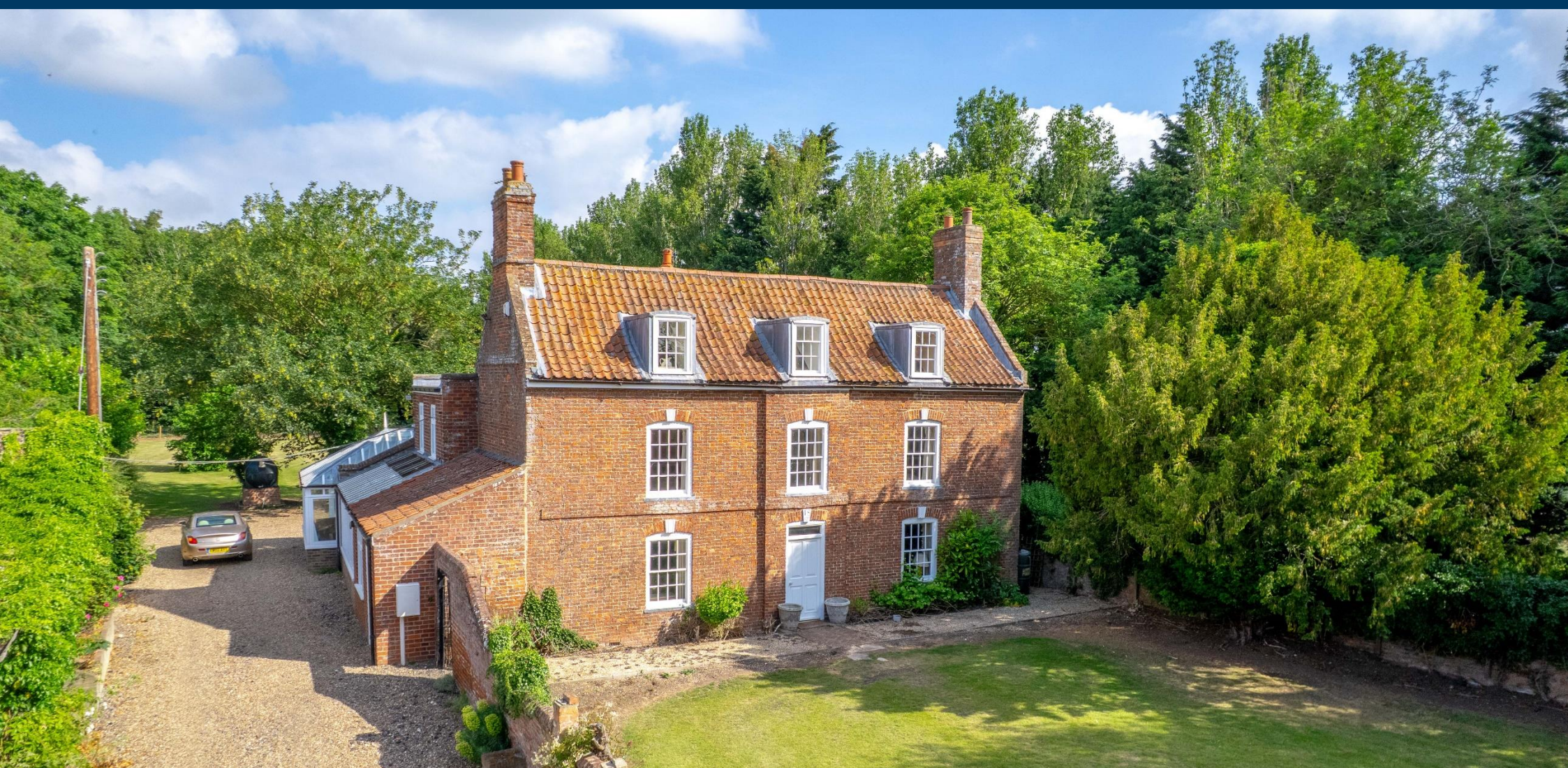
The Old Farmhouse, High Lane, Croft, Skegness, Lincs, PE24 4SH