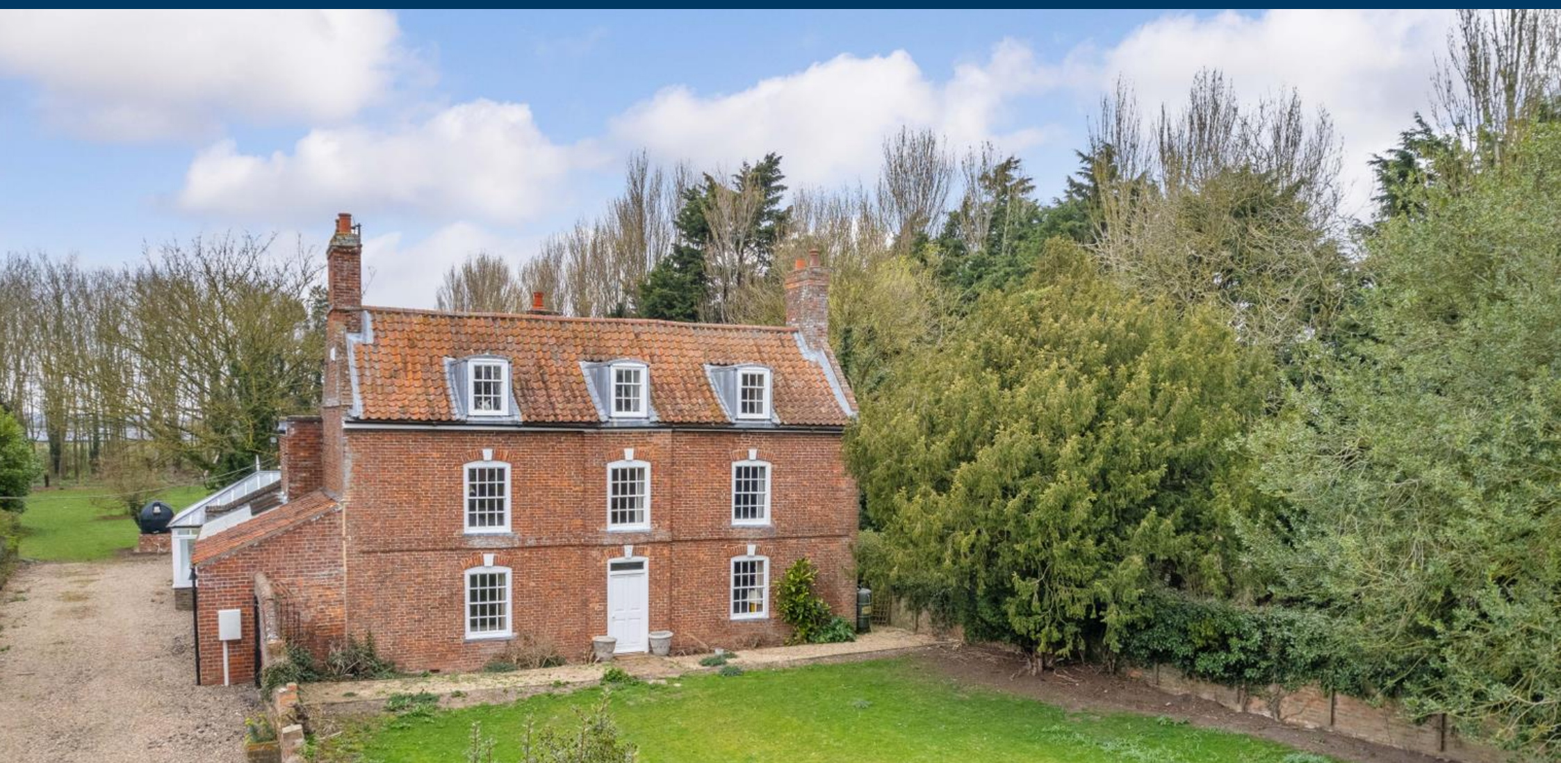
The Old Farmhouse, High Lane, Croft, Skegness, Lincs, PE24 4SH