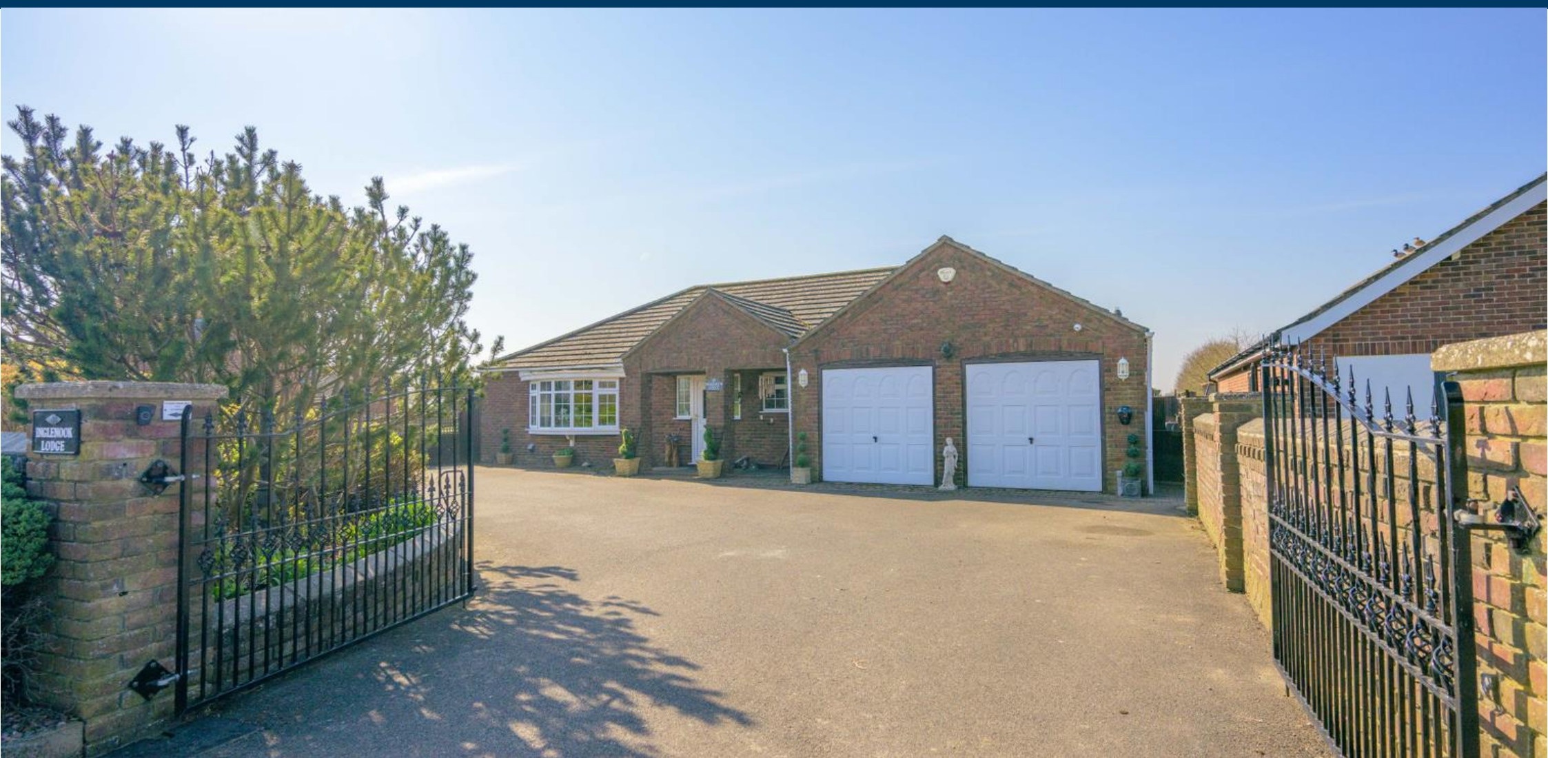
Inglenook Lodge, Doubledays Lane, Burgh Le Marsh, PE24 5EN