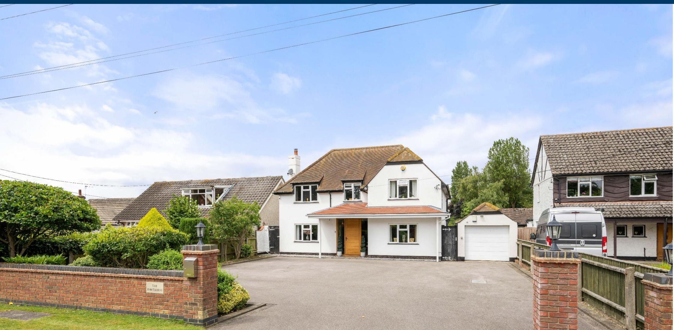
The Hawthorns, 376 Gibraltar Road, Skegness, Lincs, PE25 3BB