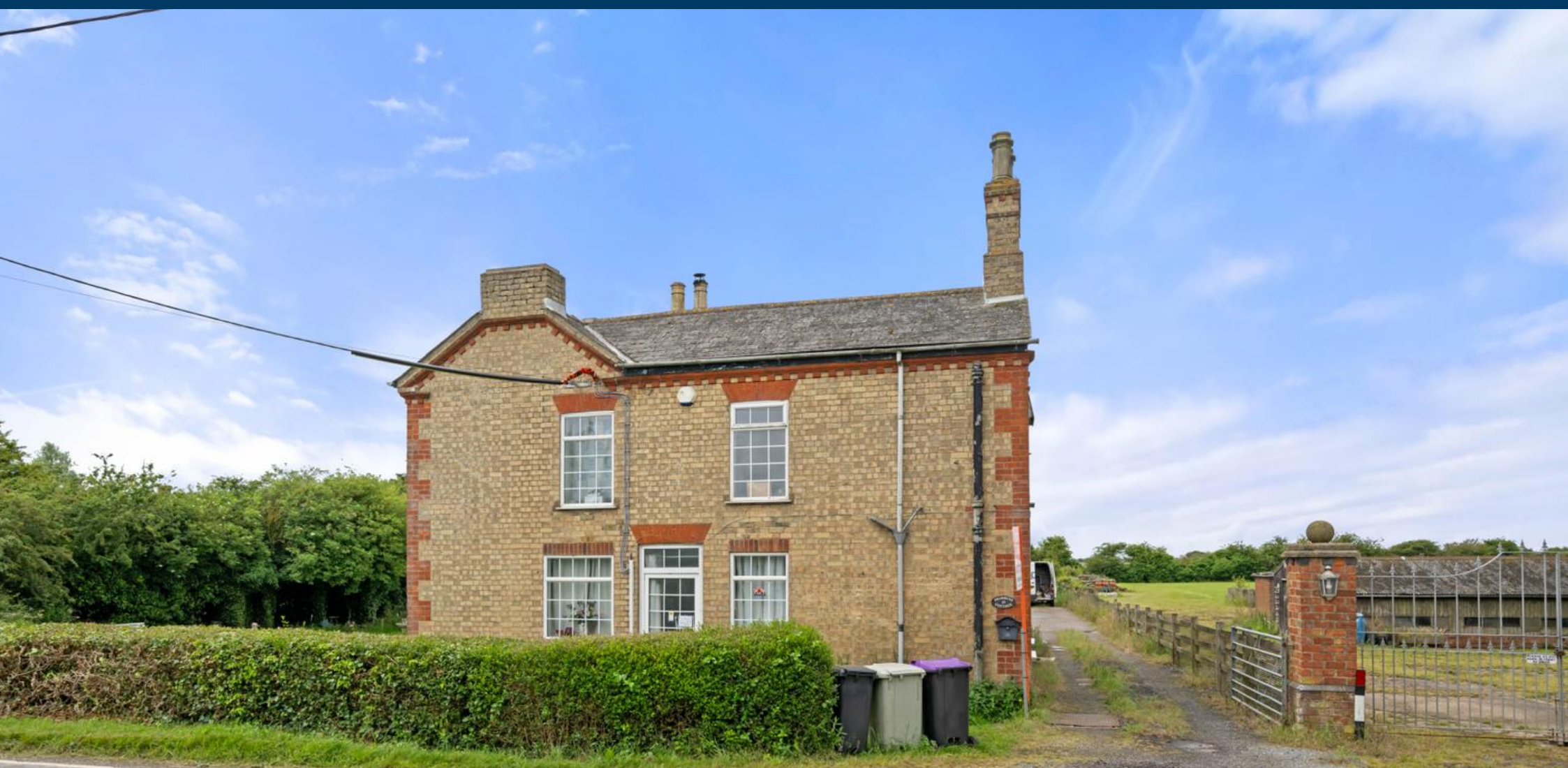
Primrose Cottage, West End, Hogsthorpe, PE24 5PA