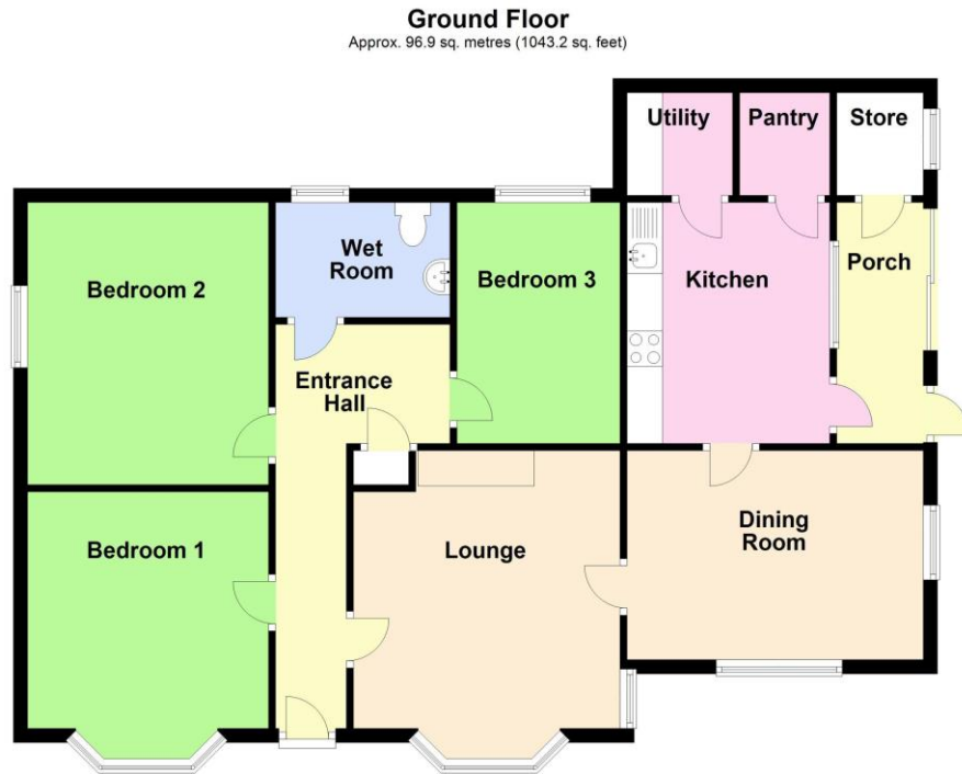
Total area: approx. 96.9 sq. metres (1043.2 sq. feet)