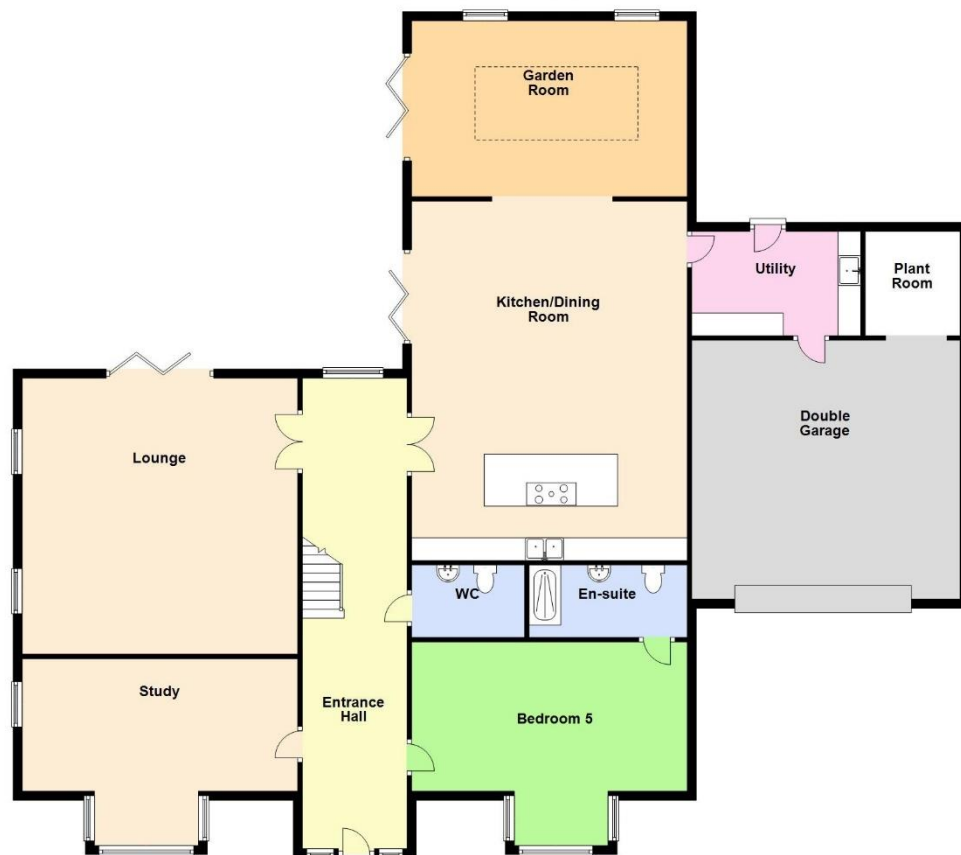
Ground Floor Approx. 240.0 sq. metres (2583.2 sq. feet)