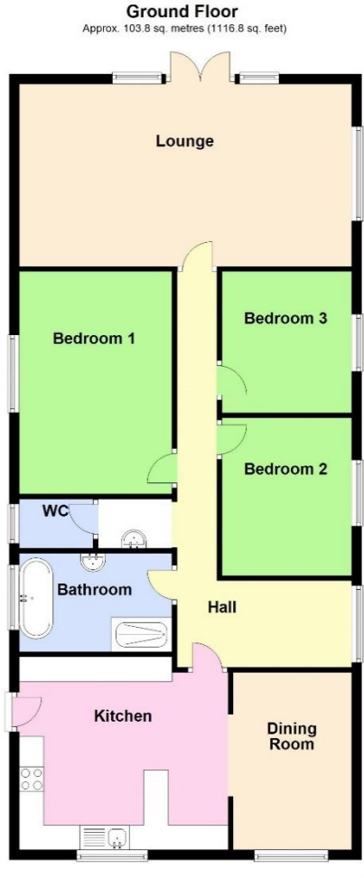
Total area: approx. 103.8 sq. metres (1116.8 sq. feet)