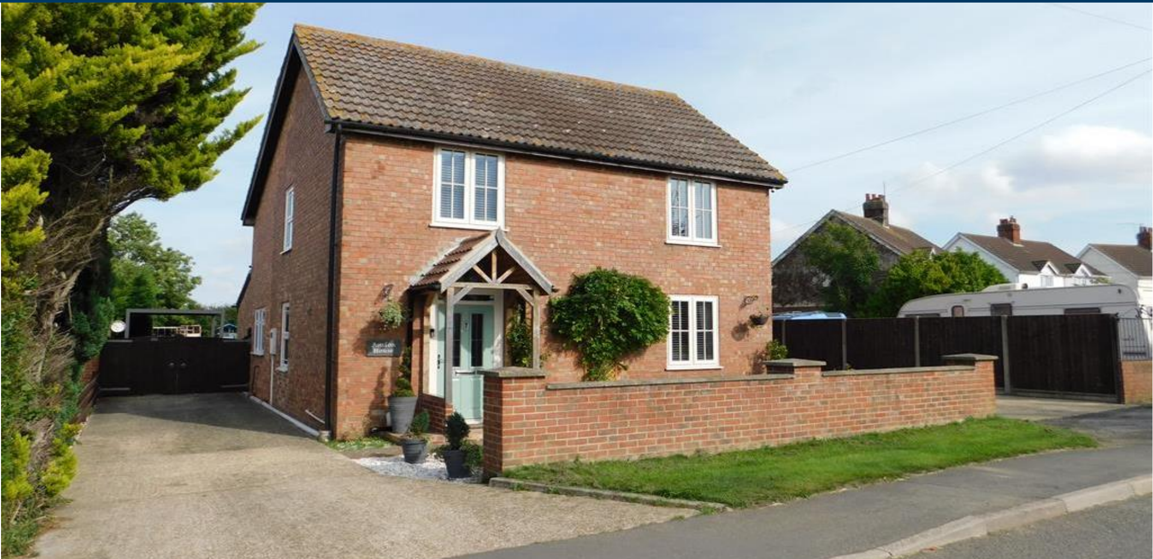
Avalon House, Station Road, Firsby Spilsby, Lincs PE23 5PX