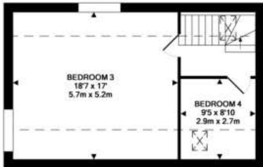
2ND FLOOR APPROX. FLOOR AREA 466 SQ. FT. (43.3 SQ. M.)

TOTAL APPROX. FLOOR AREA 1768 SQ. FT. (164.2 SQ. M.) While every attempt has been made to ensure the accuracy of the floor plan contained here, measurements of doors, windows, rooms and any other items are approximate and no responsibility is taken for any error, omission, or mis-statement. This plan is for illustrative purposes only and should be used as such by any prospective purchaser. The services, systems and appliances shown have not been tested and no guarantee as to their operability or efficiency can be given. Made with Metropu ©2015