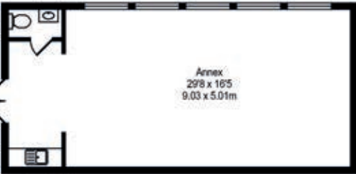
Approx. Floor Area 581 Sq.Ft (54.00 Sq.M.)