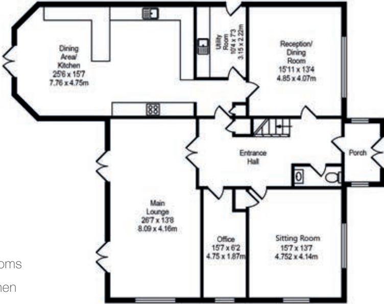
Approx. Floor Area 1654 Sq.Ft (153.66 Sq.M.)