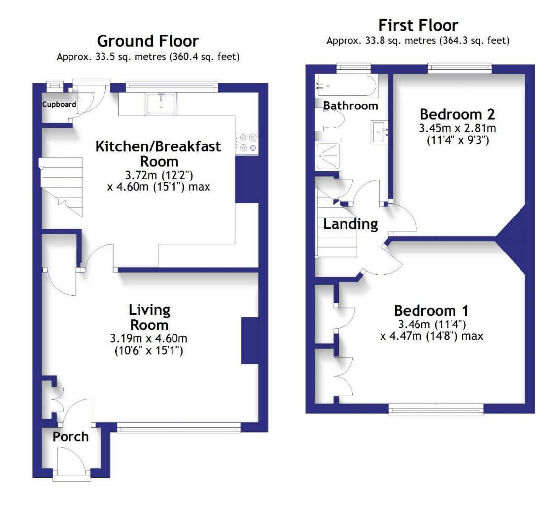
Total area: approx. 67.3 sq. metres (724.7 sq. feet)