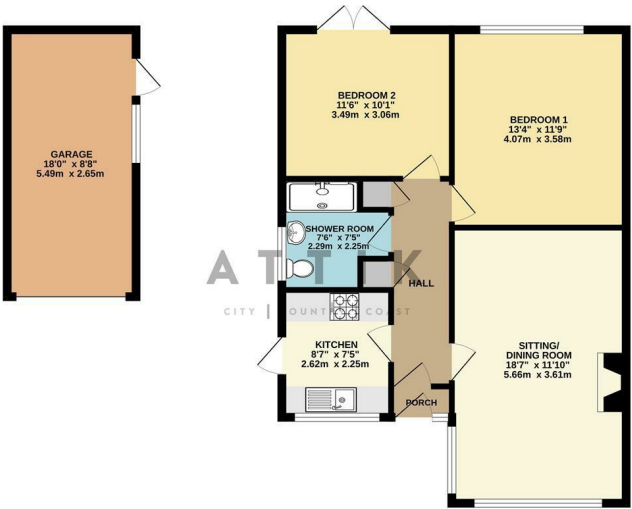
GROUND FLOOR 669 sq.ft. (62.1 sq.m.) approx.

TOTAL FLOOR AREA: 825 sq.ft. (76.7 sq.m.) approx. While every effort has been made to ensure the accuracy of the foregoing information, measurements of floors, windows, doors and any other items are approximate and no responsibility is taken for any errors, omissions or misstatements. This plan is for illustrative purposes only and should be used as such for any prospective purchase. The services, systems and appliances shown have not been tested and no guarantee is given as to their operation or efficiency at the time of sale. Made with iStockphoto