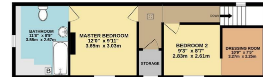
1ST FLOOR 459 sq.ft. (42.7 sq.m.) approx.