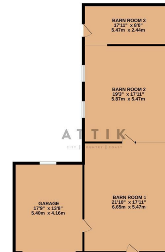
THE LANTERN BARN 1123 sq.ft. (104.3 sq.m.) approx.

TOTAL FLOOR AREA: 1123 sq.ft. (104.3 sq.m.) approx. While every attempt has been made to ensure the accuracy of the figures contained here, measurements of floors, walls, rooms etc. are given for an approximate and are not intended to be used for any purpose other than that of a guide only. The services, systems and appliances shown have not been tested and no guarantee is given as to their operation or efficiency at the time of the print. Made with Neoplan 12002