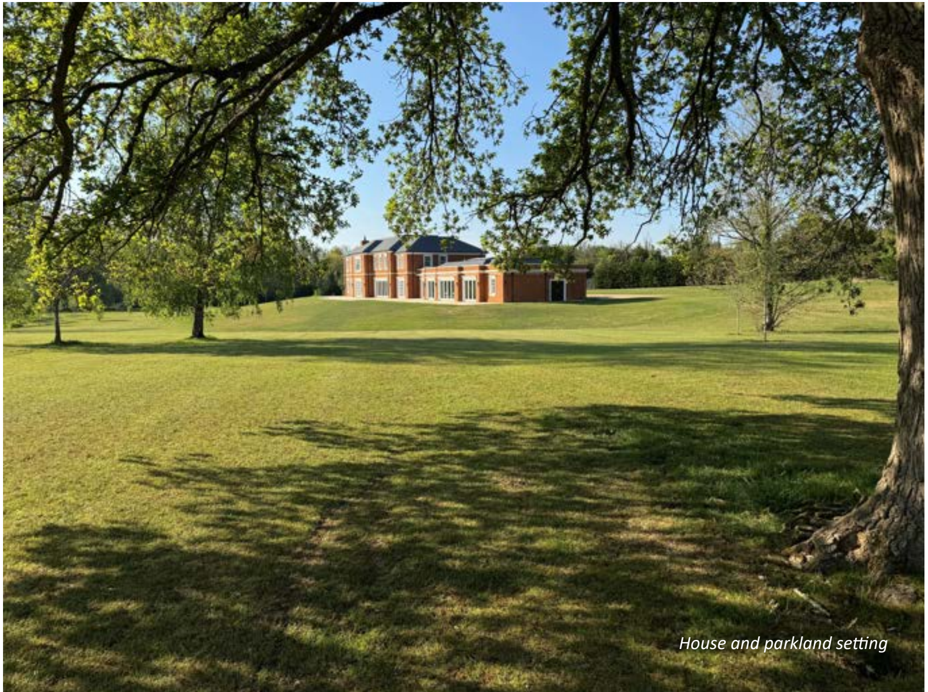
House and parkland setting