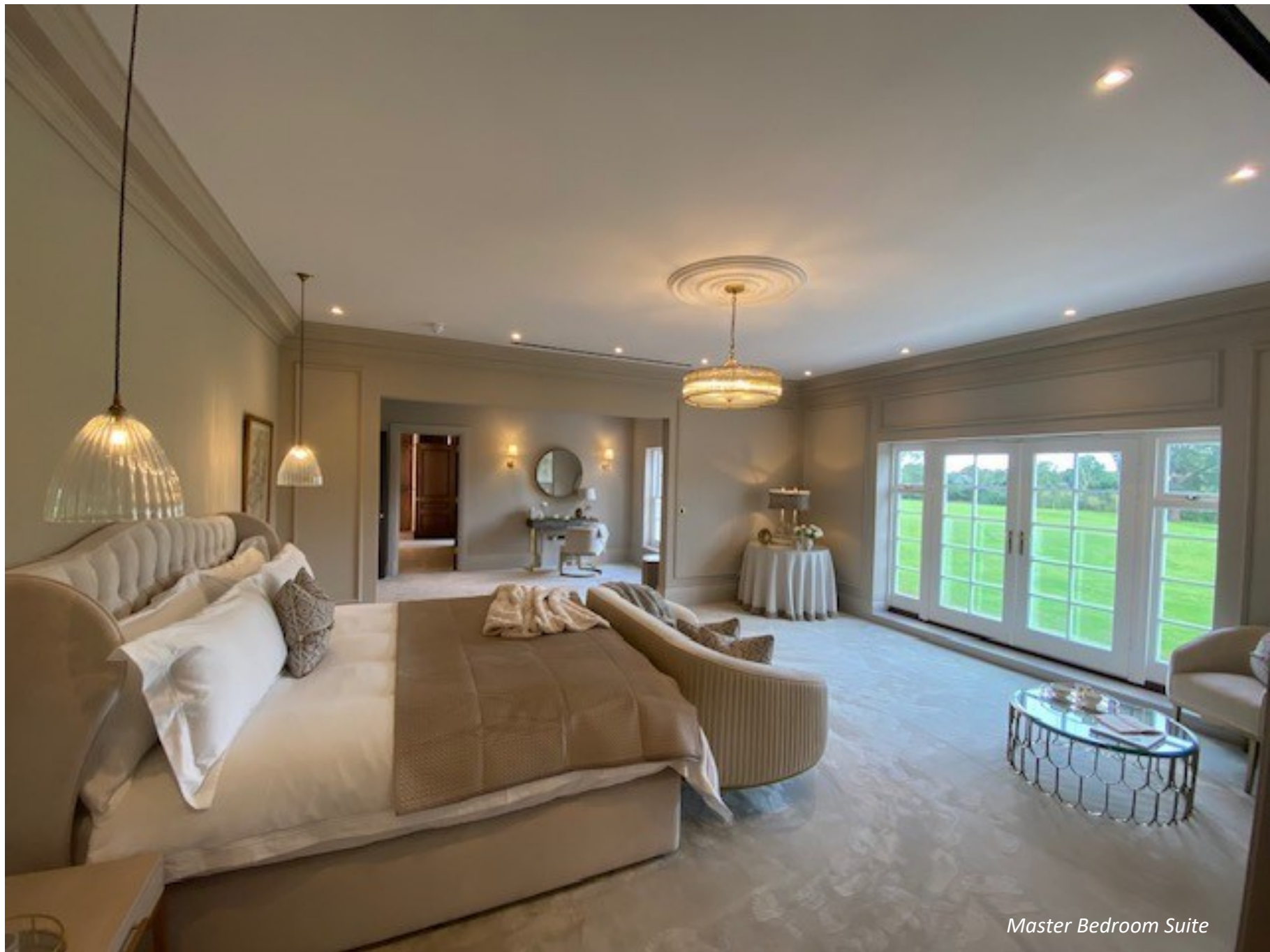
Master Bedroom Suite