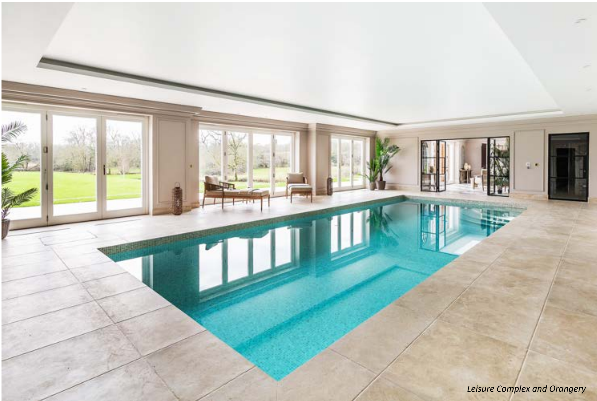
Leisure Complex and Orangery