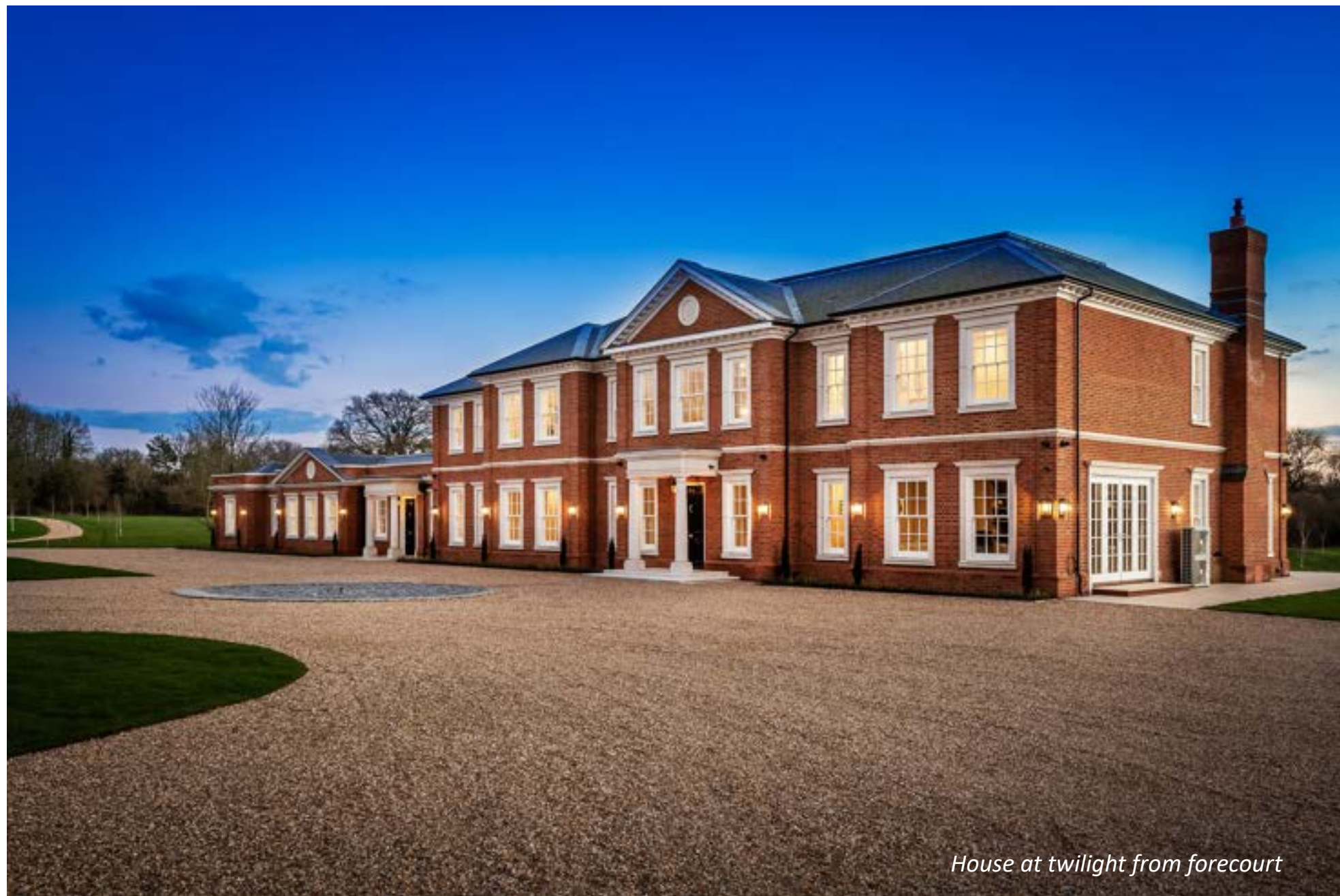
House at twilight from forecourt