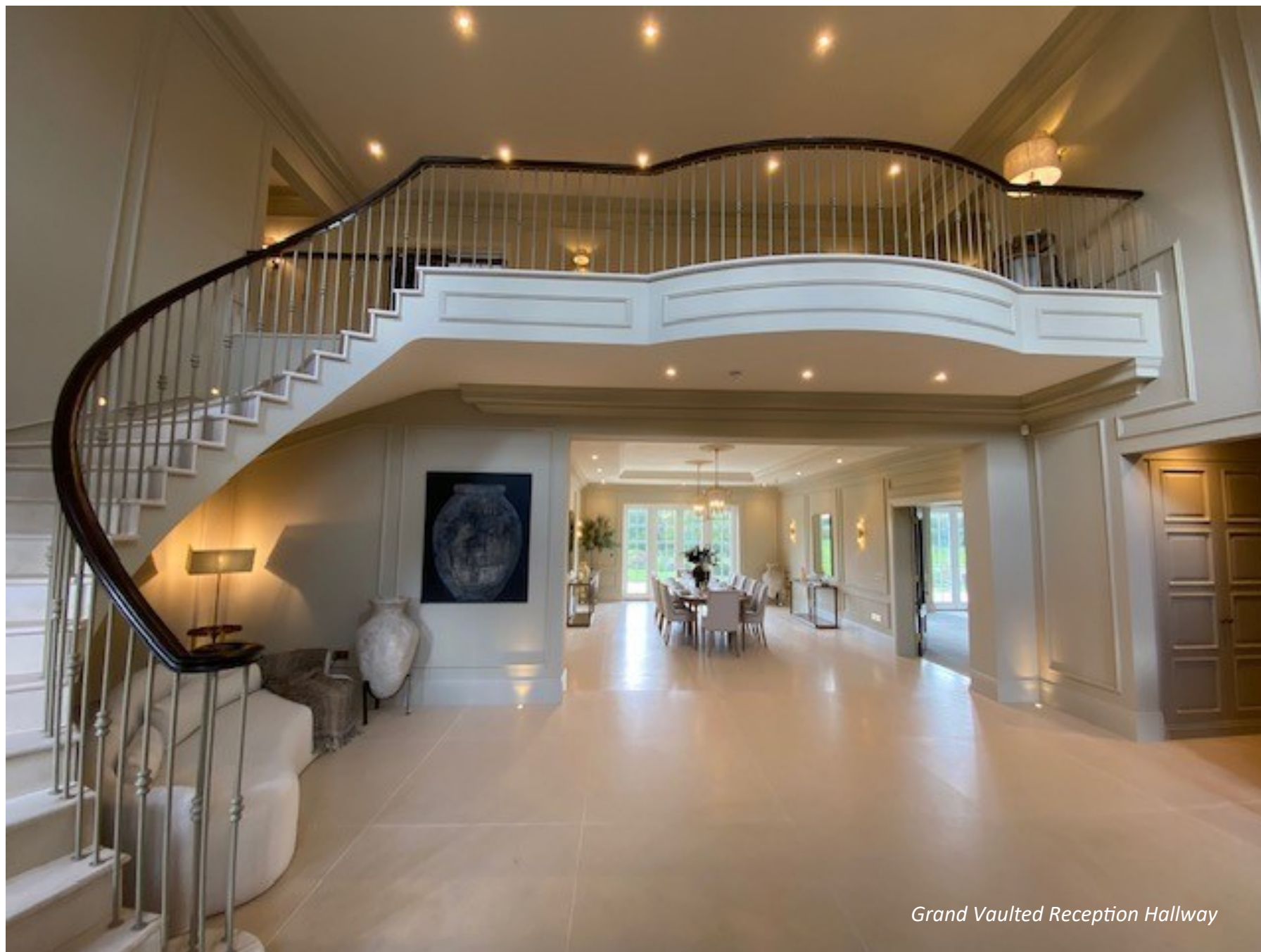
Grand Vaulted Reception Hallway