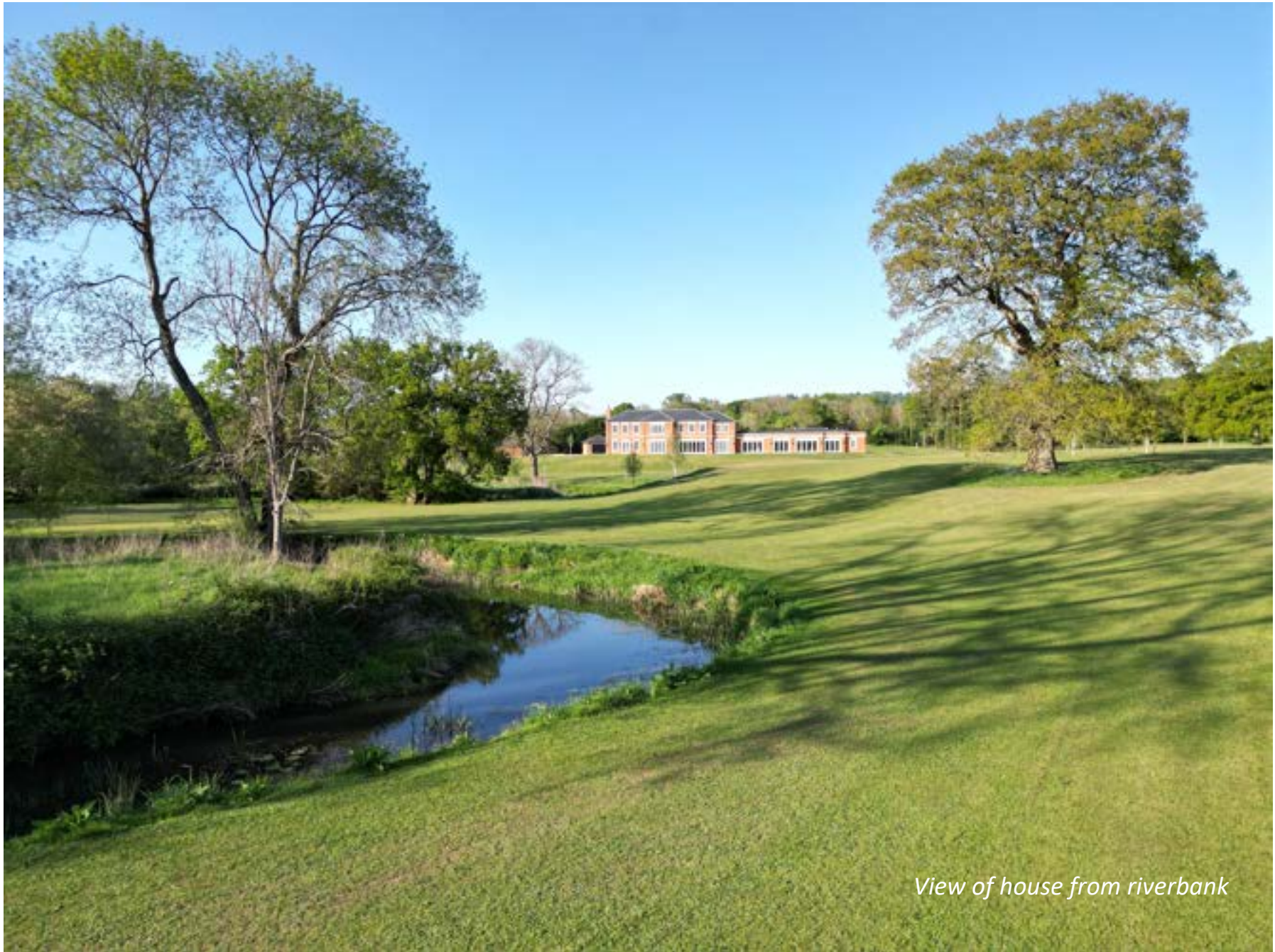
View of house from riverbank