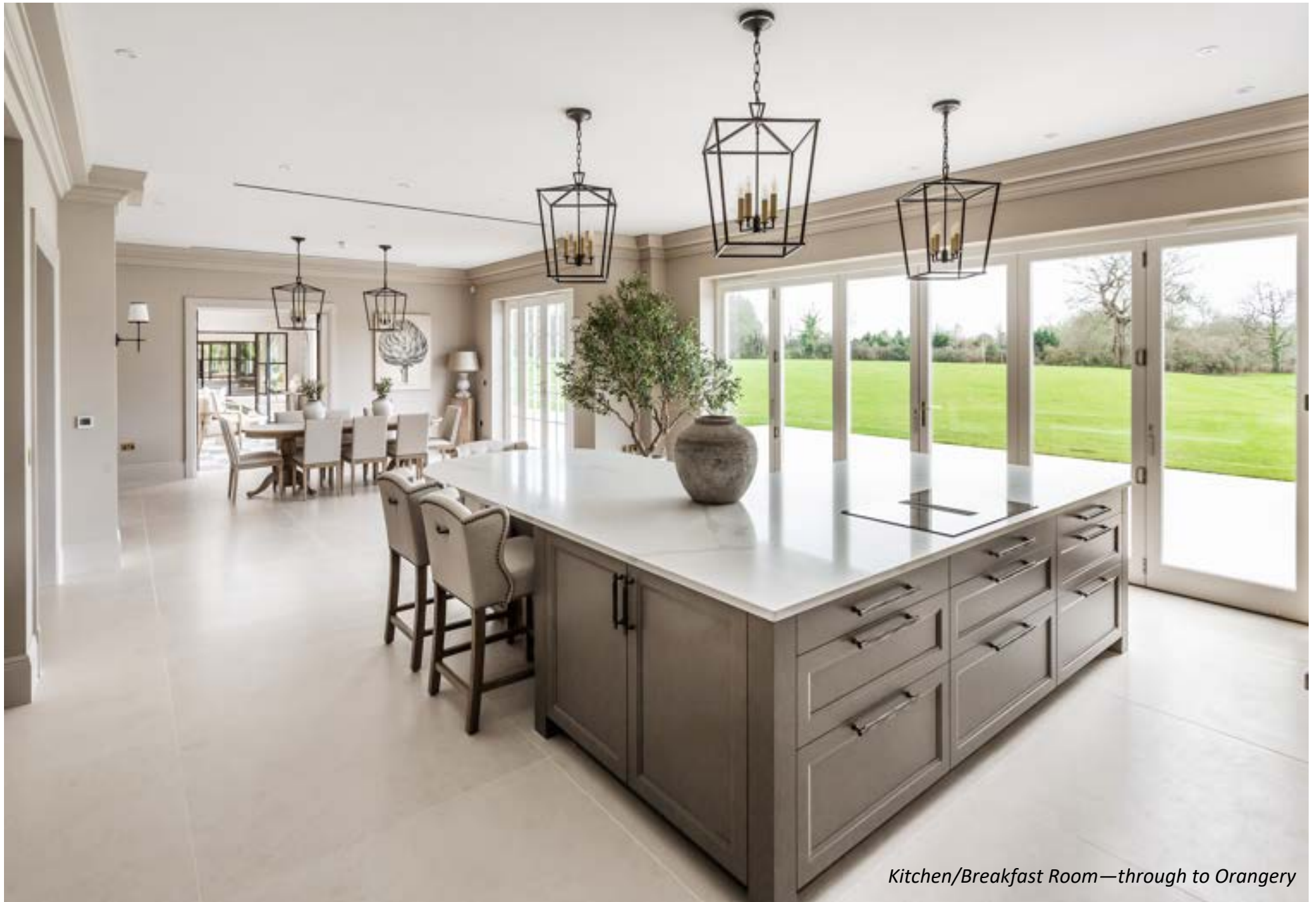
Kitchen/Breakfast Room—through to Orangery