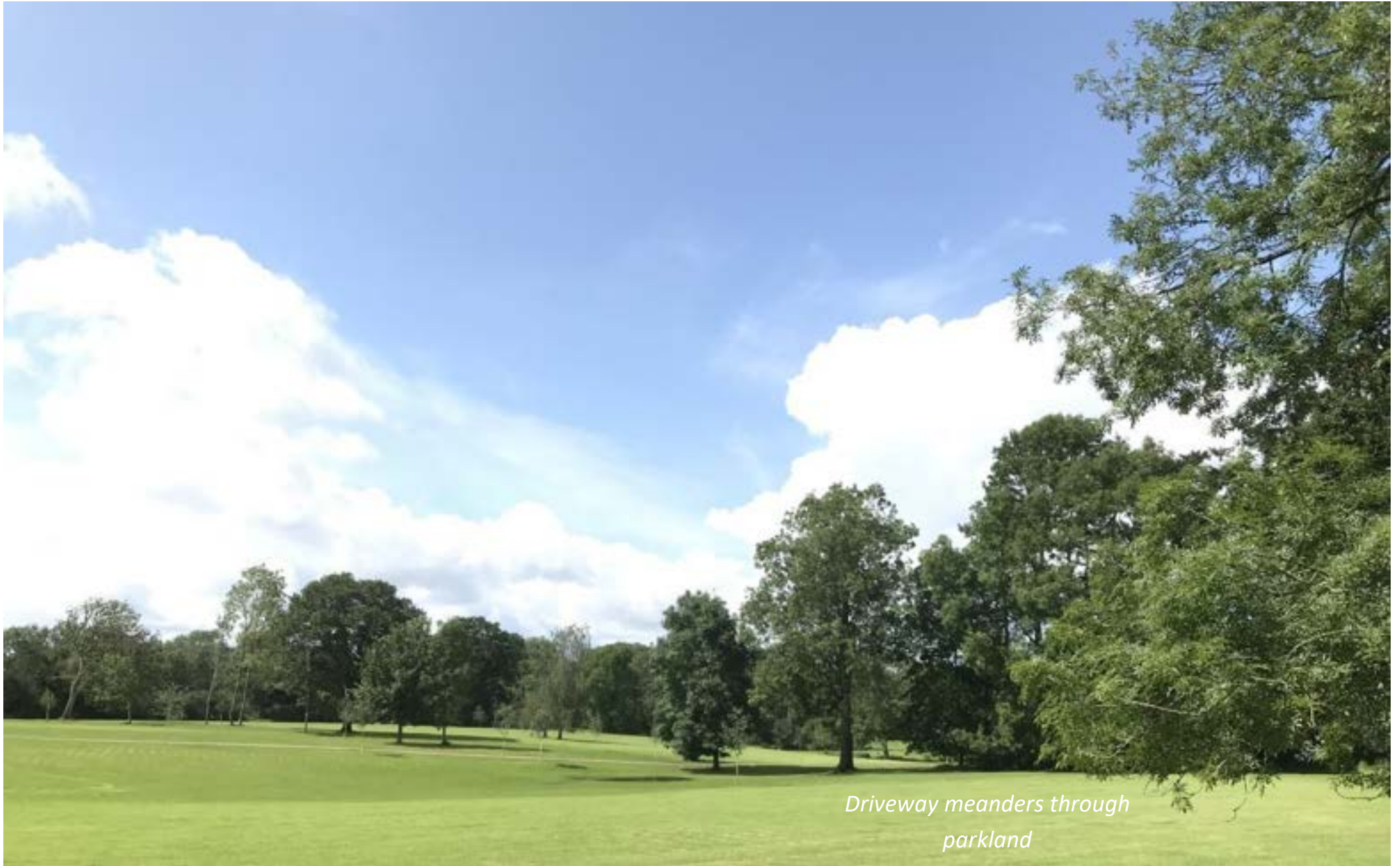
Driveway meanders through parkland