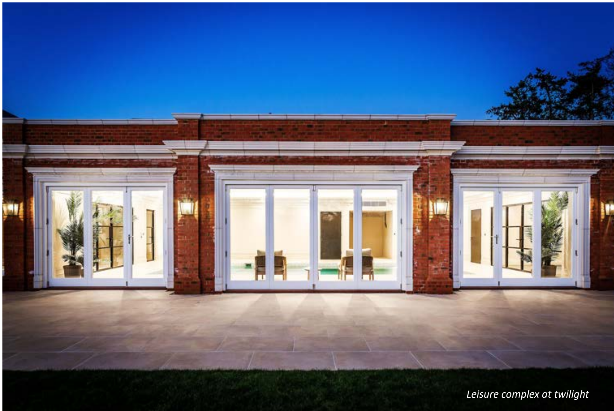
Leisure complex at twilight