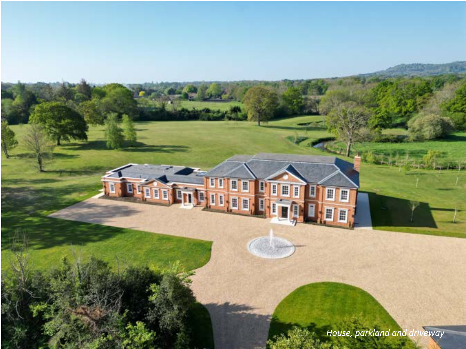
House, parkland and driveway