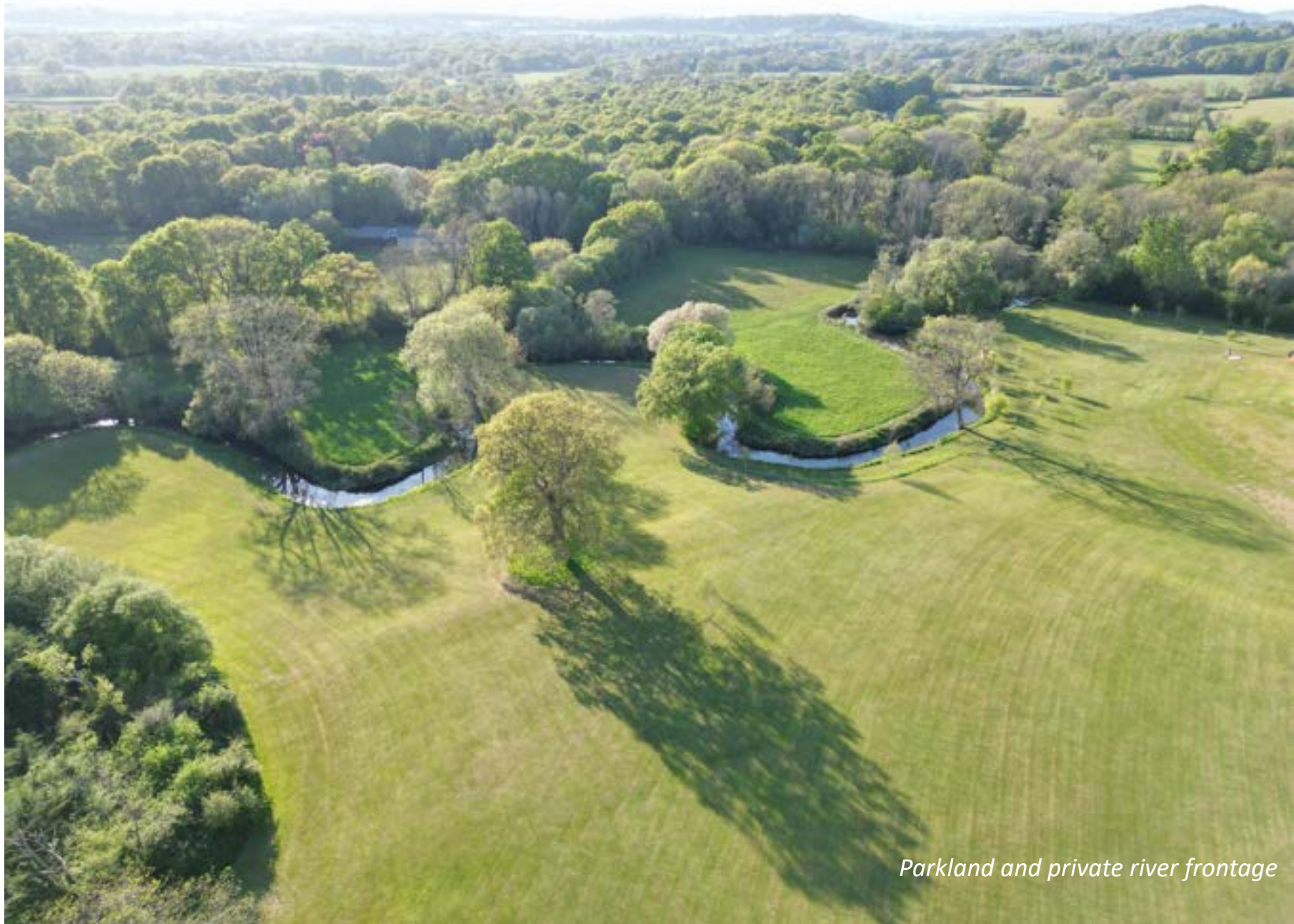
Parkland and private river frontage