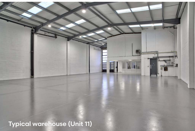
Typical warehouse (Unit 11)