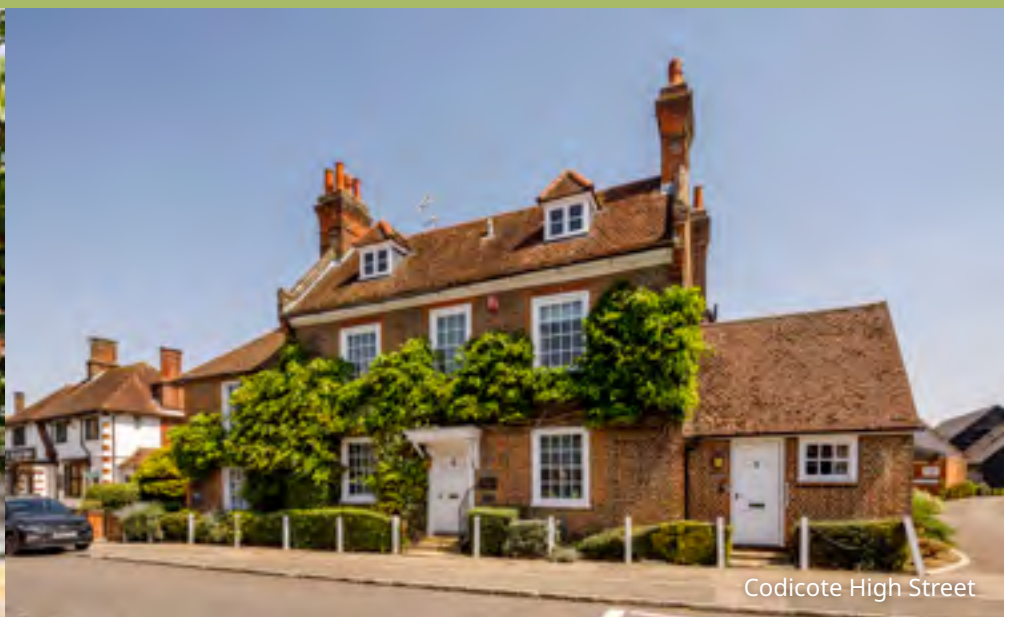
Codicote High Street