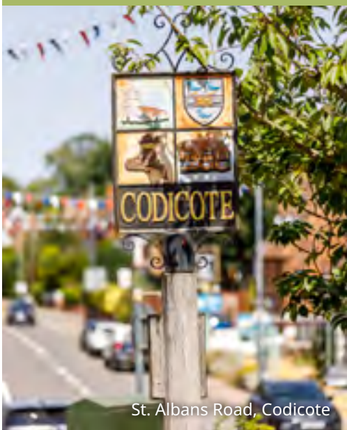
St. Albans Road, Codicote