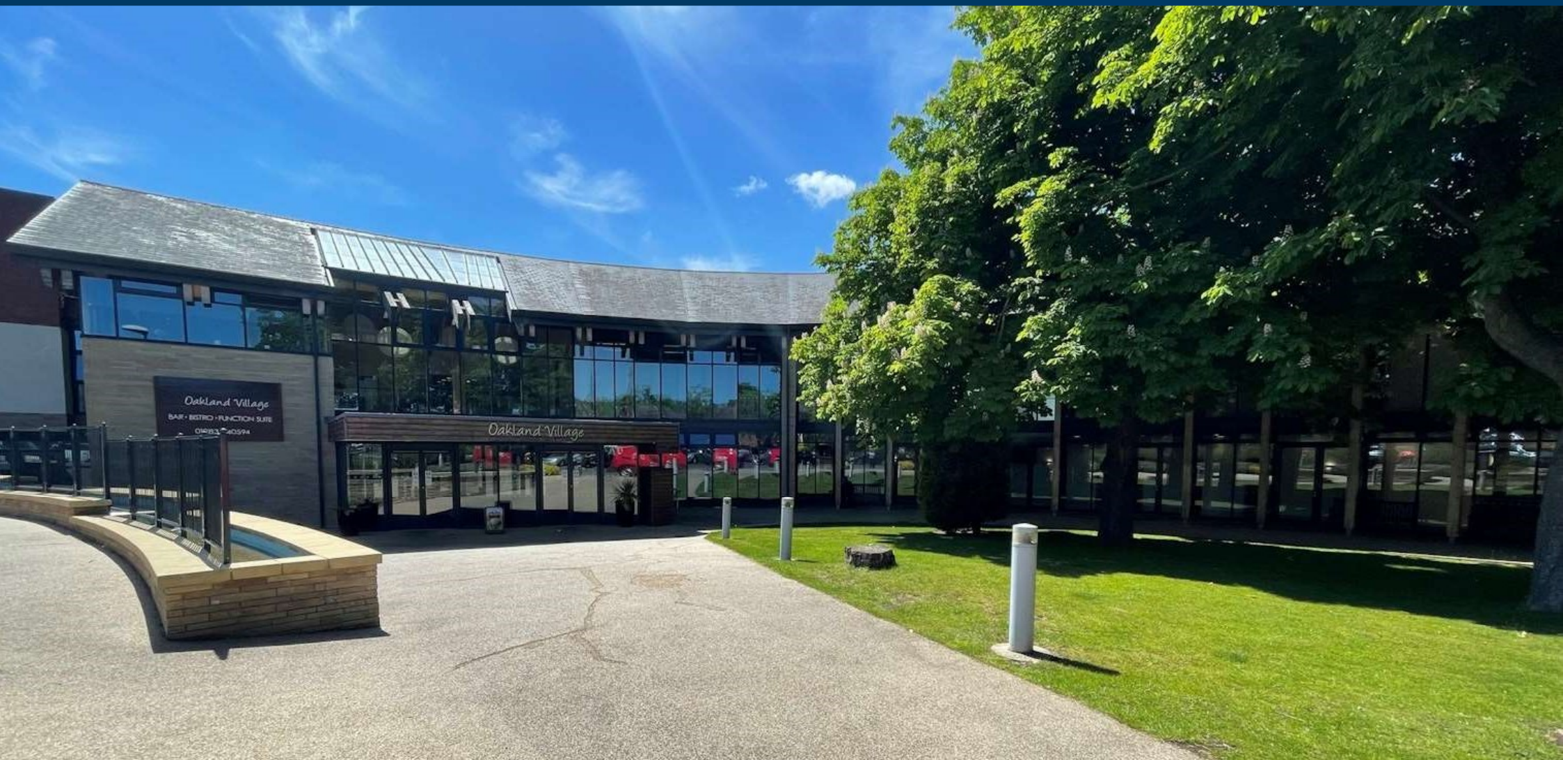
Oaklands Village, Swadlincote, Derbyshire