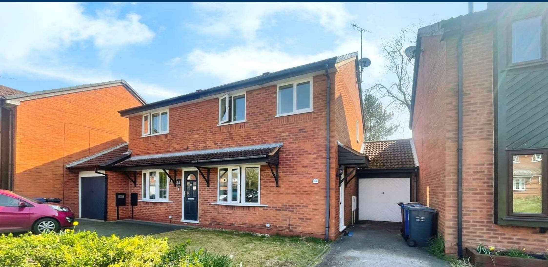
Goodwood Close, Stretton, Burton-on-Trent