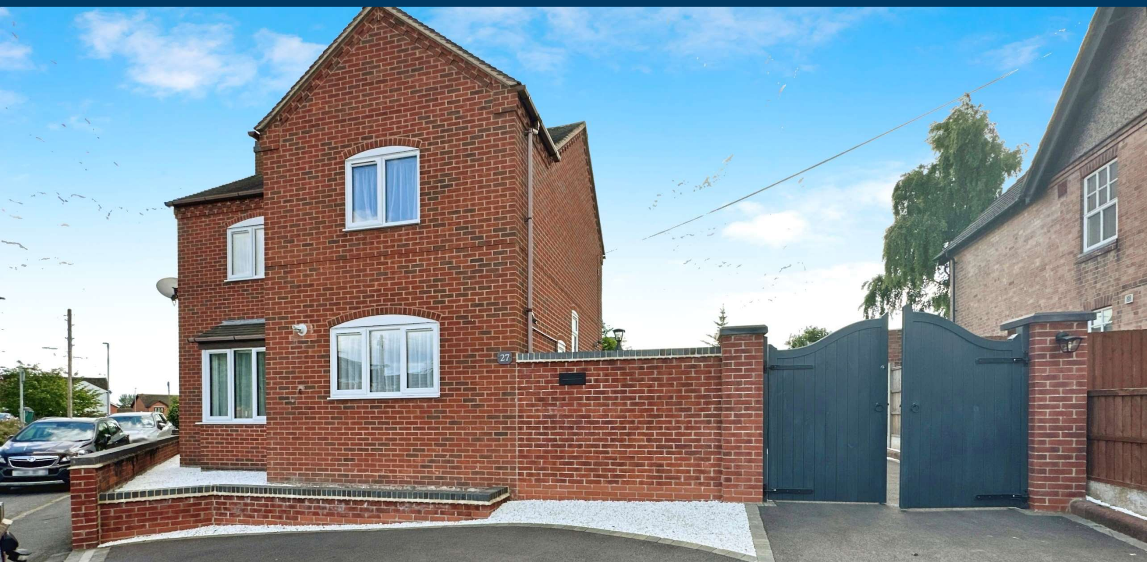
The Green, Stretton, Burton-on-Trent