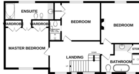
1ST FLOOR 811 sq.ft. (75.4 sq.m.) approx.