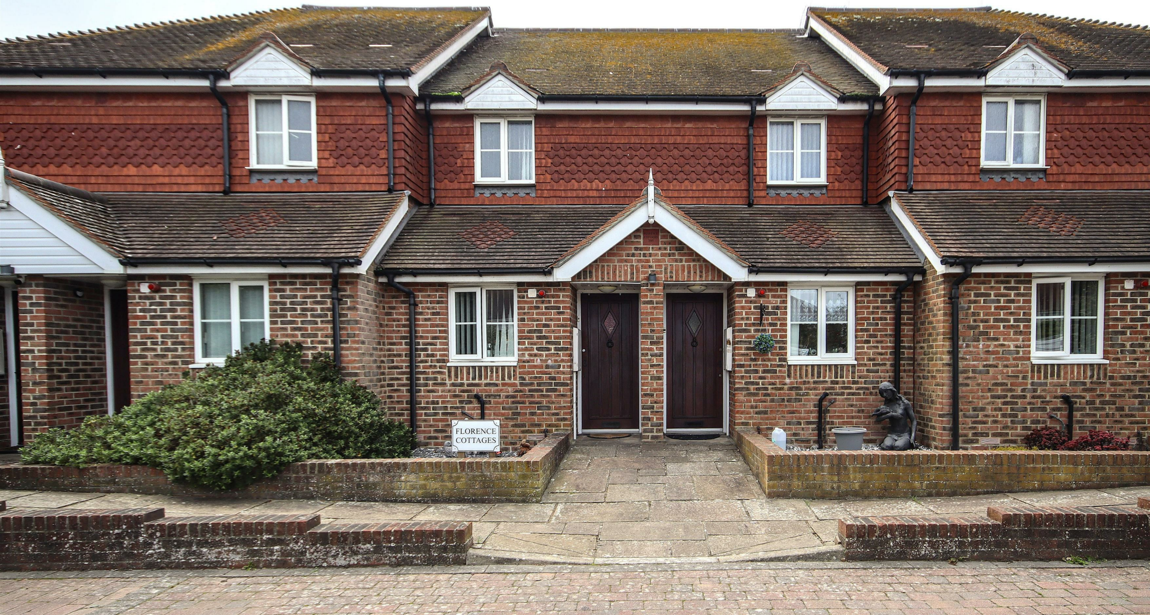
3 Florence Cottages, Wembley Gardens, Lancing, BN15 9WF £1,100 Per Calendar Month