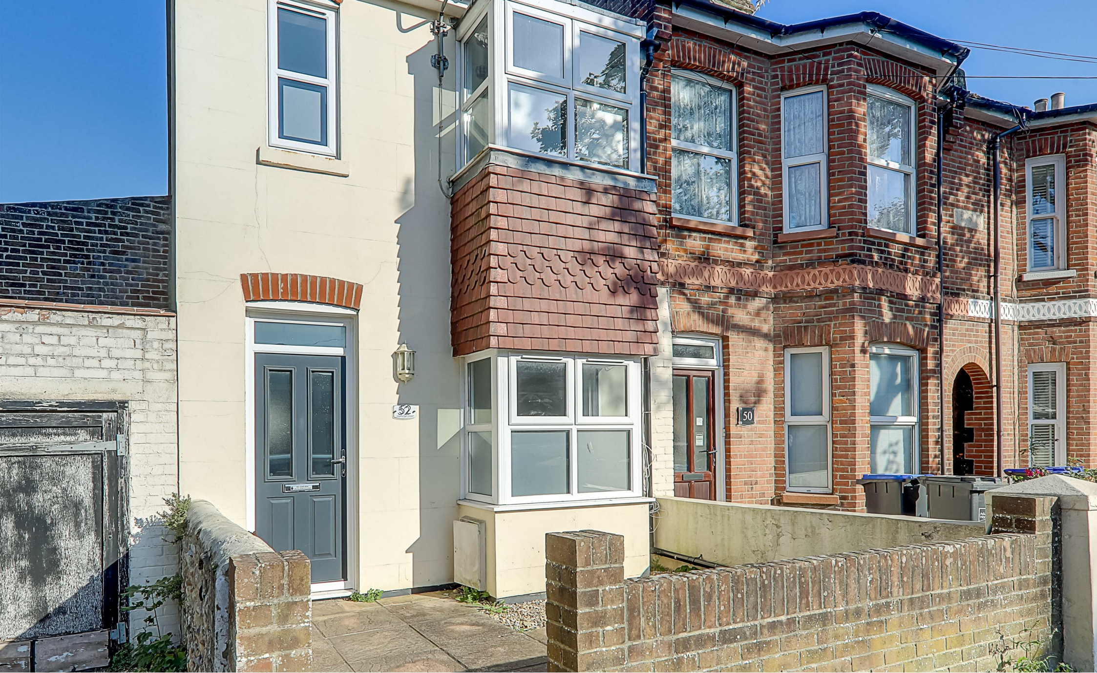
52 Upper High Street, Worthing, BN11 1DR Guide Price £325,000