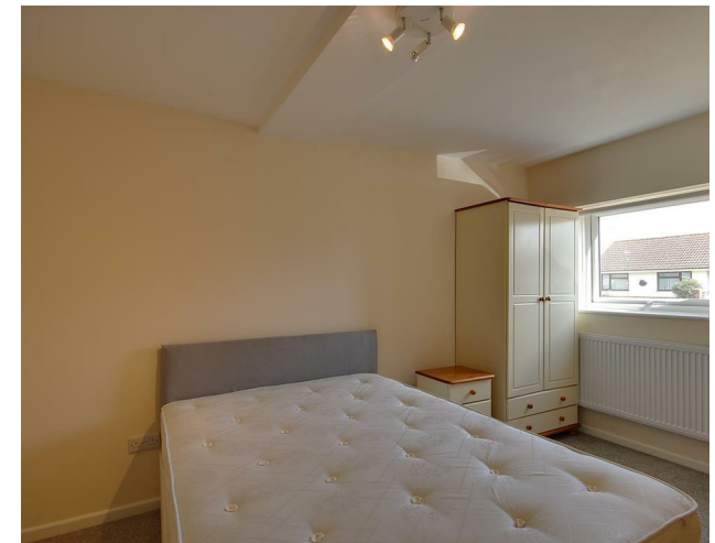
Spacious Double En-Suite Room in Five-Bed HMO. Couples Welcome.

We're delighted to offer this well-presented double en-suite room within a five-bedroom HMO, ideally located in Lancing – close to the seafront, excellent transport links, and a range of local amenities. The room is generously sized and furnished with a bed, mattress, and storage units. It also benefits from a private en-suite shower and a basin / WC. The property features modern communal spaces, including a fully equipped kitchen, a comfortable living area, and a separate dining room with access to attractive, well-maintained gardens. Additional features: Gas central heating; Double-glazed windows and unallocated parking available at the front of the property. Council Tax Band: D. EPC Rating: D. Available now – early viewing recommended.