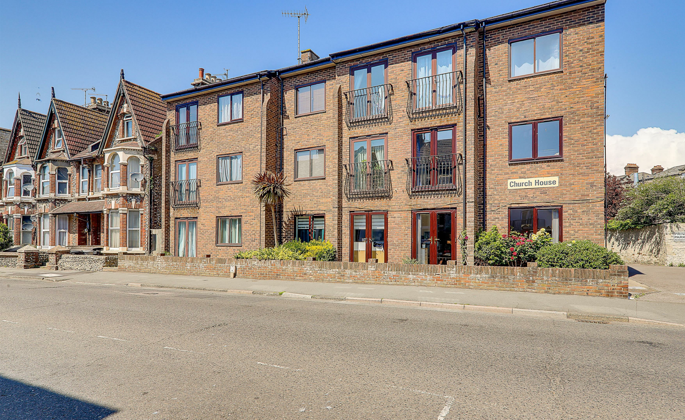
6 Church House, Littlehampton, BN17 5AU Asking Price £195,000