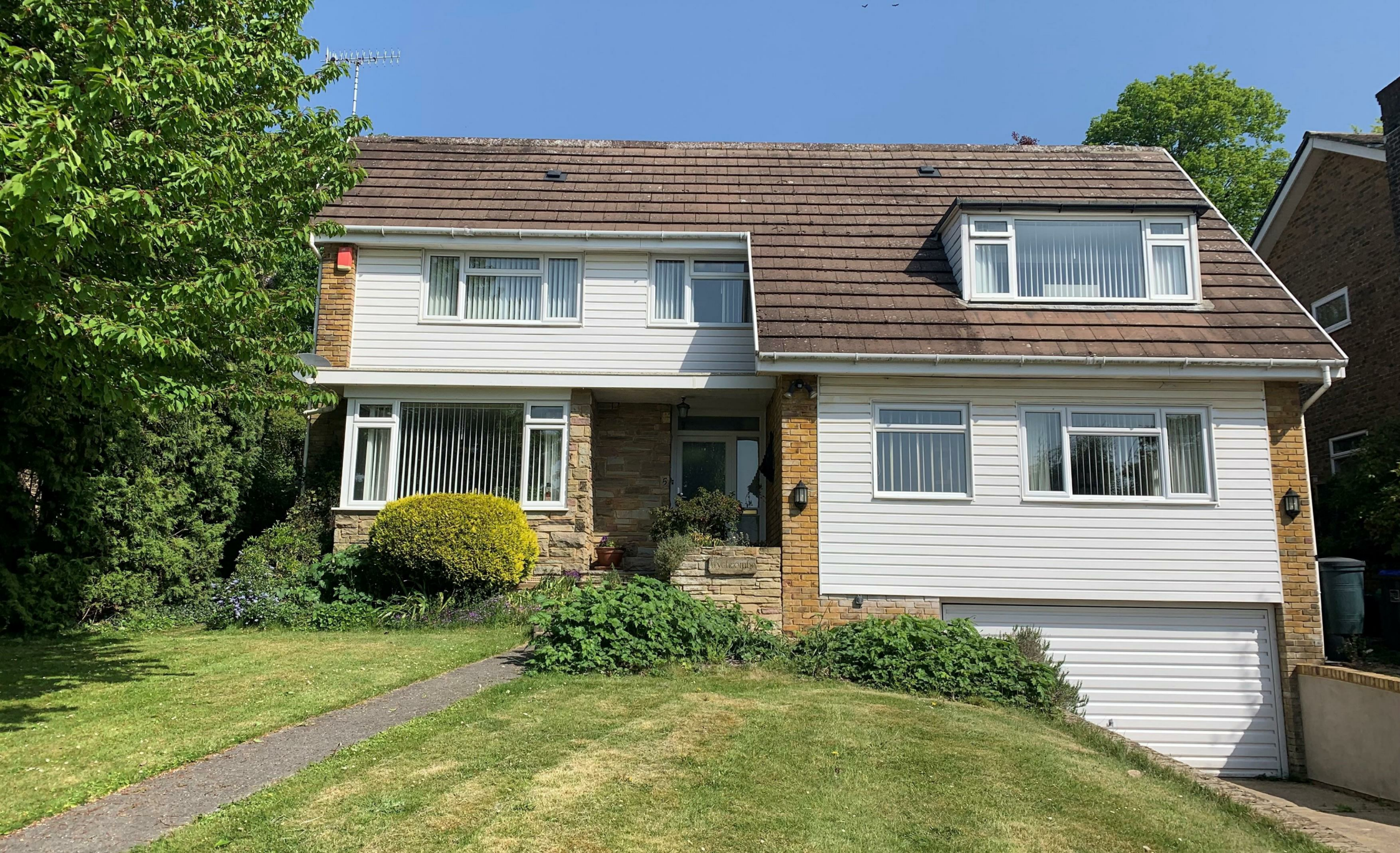
5 Longlands Spinney, Charmandean, Worthing, BN14 9NU Guide Price £880,000