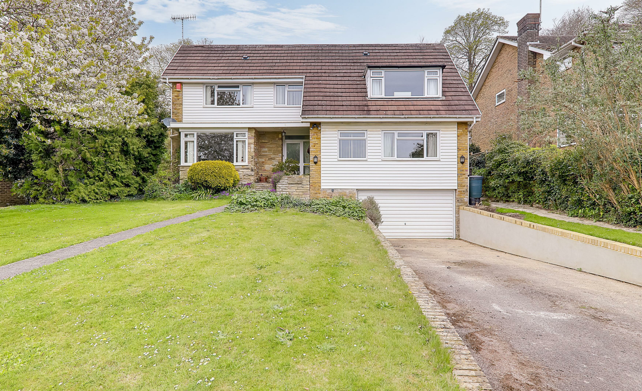
5 Longlands Spinney, Charmandean, Worthing, BN14 9NU Guide Price £900,000