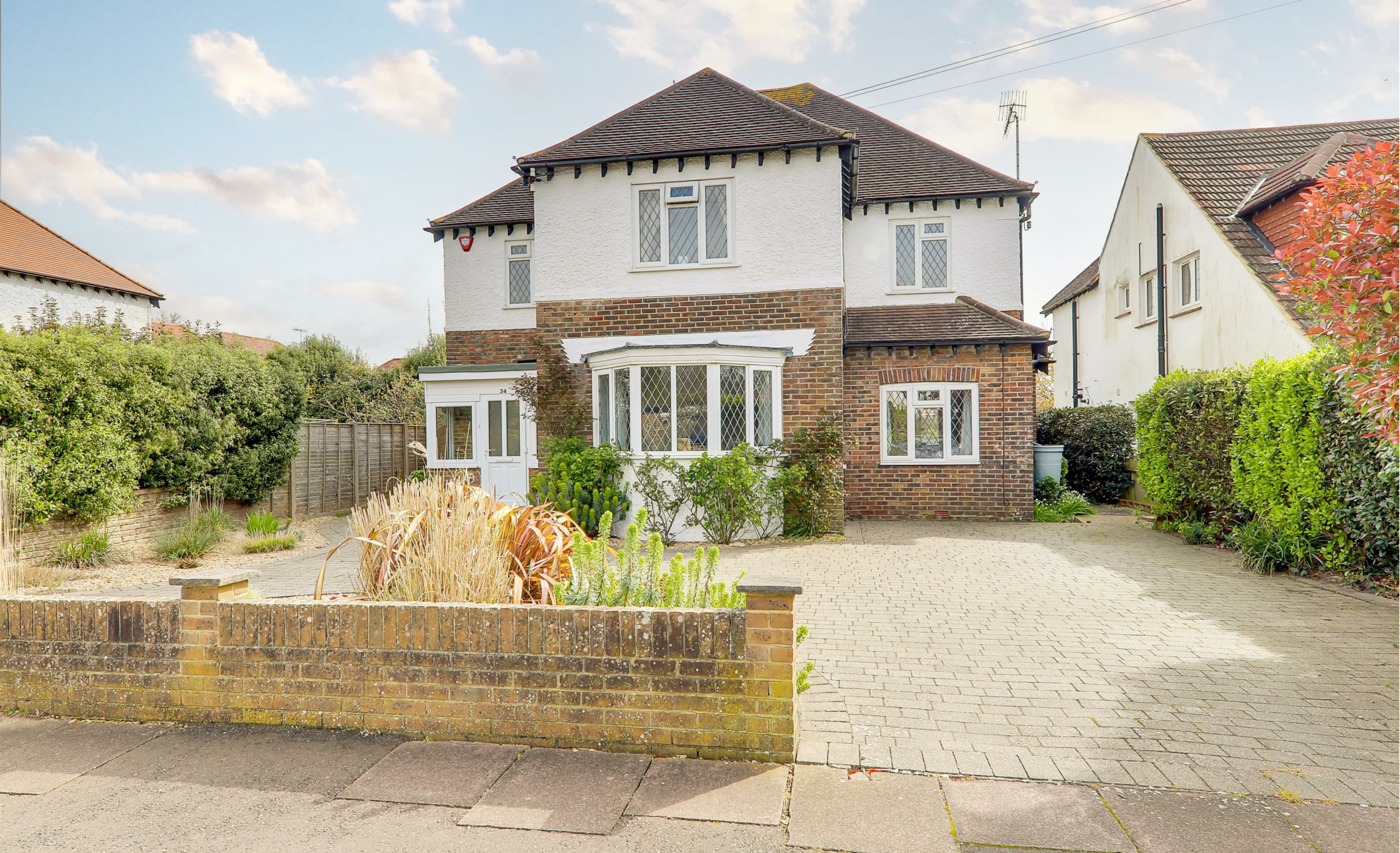
34 Offington Gardens, Offington, Worthing, BN14 9AU Guide Price £890,000