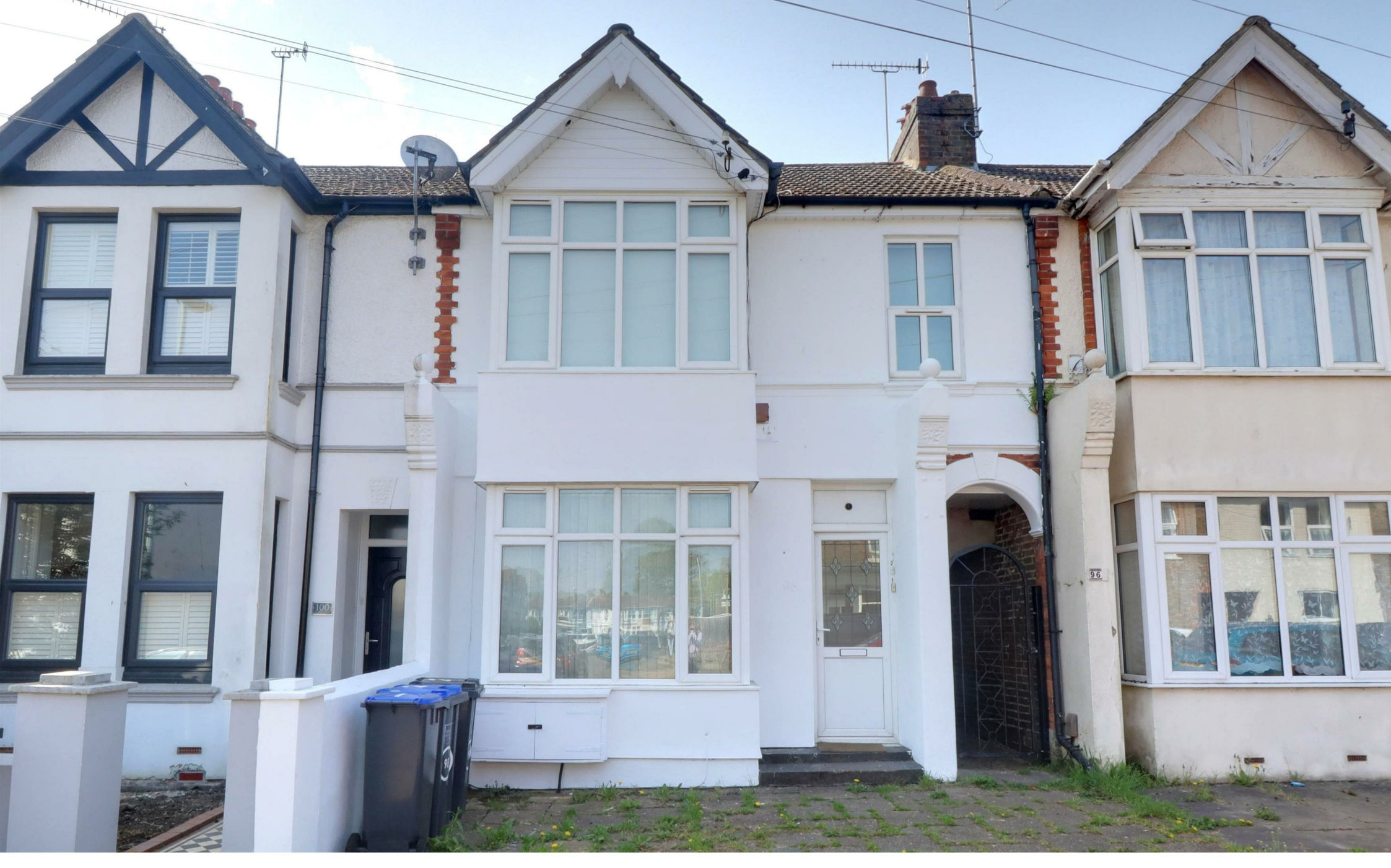
Flat 2 98 Southfield Road, Worthing, BN14 9EG Guide Price £225,000