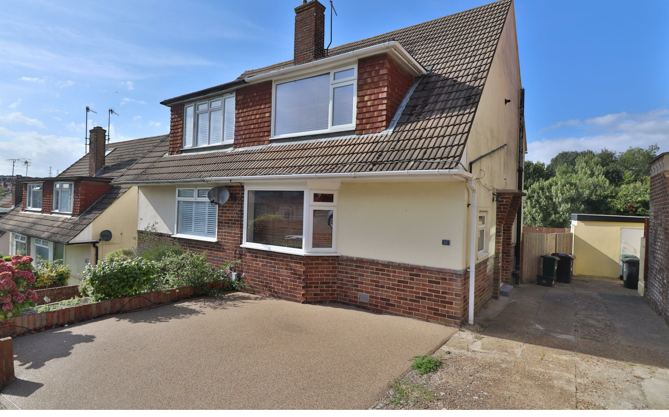
71 Overdown Rise, Portslade, BN41 2YF Guide Price £375,000