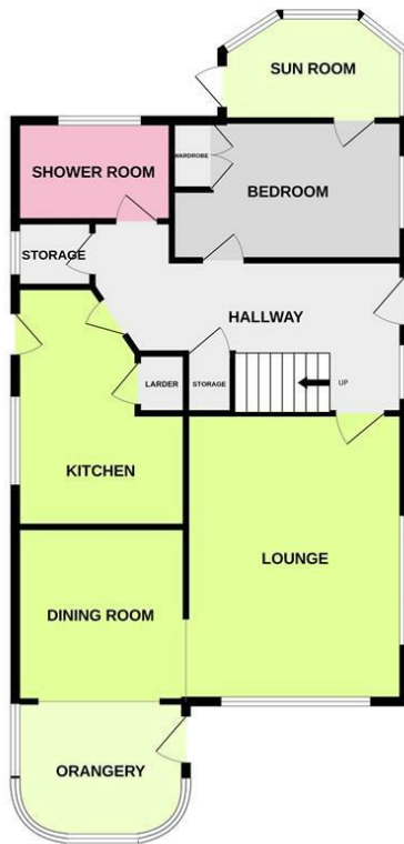
GROUND FLOOR 1002 sq.ft. (93.1 sq.m.) approx.