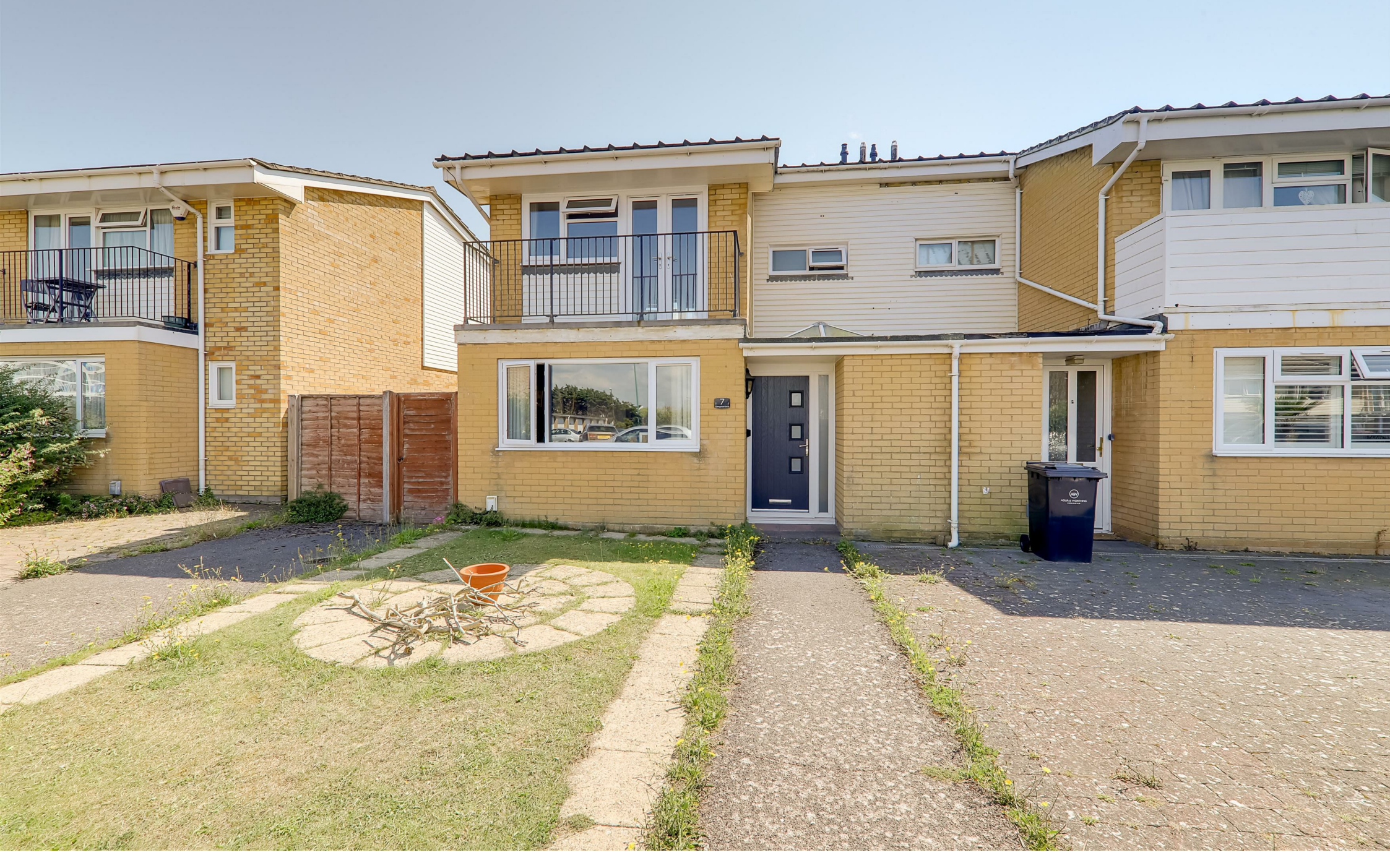
7 Collingwood Court, Shoreham-By-Sea, BN43 5SB Guide Price £525,000