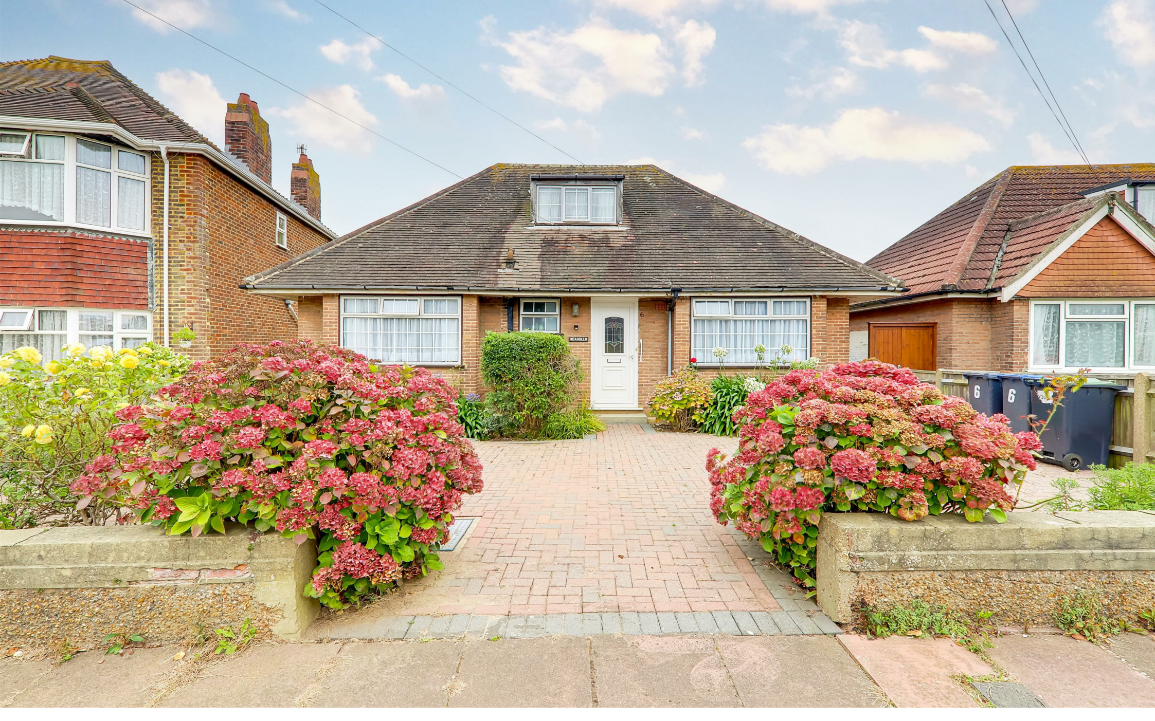
6 Seamill Park Crescent, Worthing, BN11 2PN £550,000