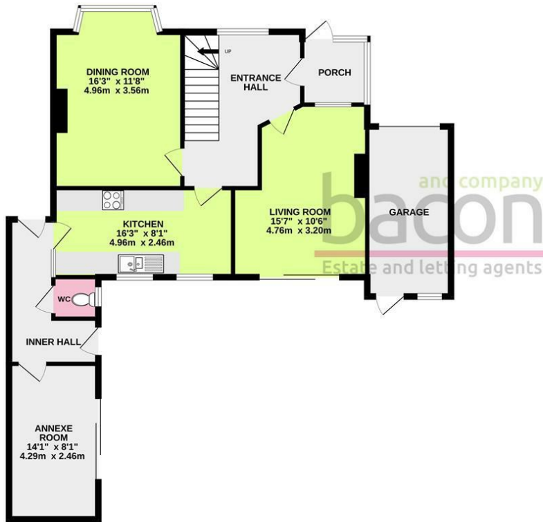
GROUND FLOOR 949 sq.ft. (88.2 sq.m.) approx.