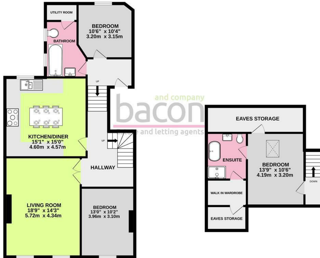
TOTAL FLOOR AREA: 1302 sq.ft. (121.0 sq.m.) approx.

Whilst every attempt has been made to ensure the accuracy of the floorplan contained here, measurements of doors, windows, rooms and any other items are approximate and no responsibility is taken for any error, omission or mis-statement. This plan is for illustrative purposes only and should be used as such by any prospective purchaser. The services, systems and appliances shown have not been tested and no guarantee as to their operability or efficiency can be given. Made with Metropix ©2024