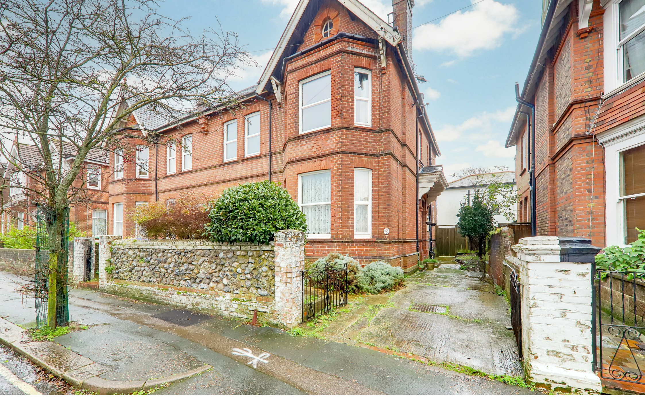
26 & 26A Salisbury Road, Worthing, BN11 1RD Guide Price £500,000