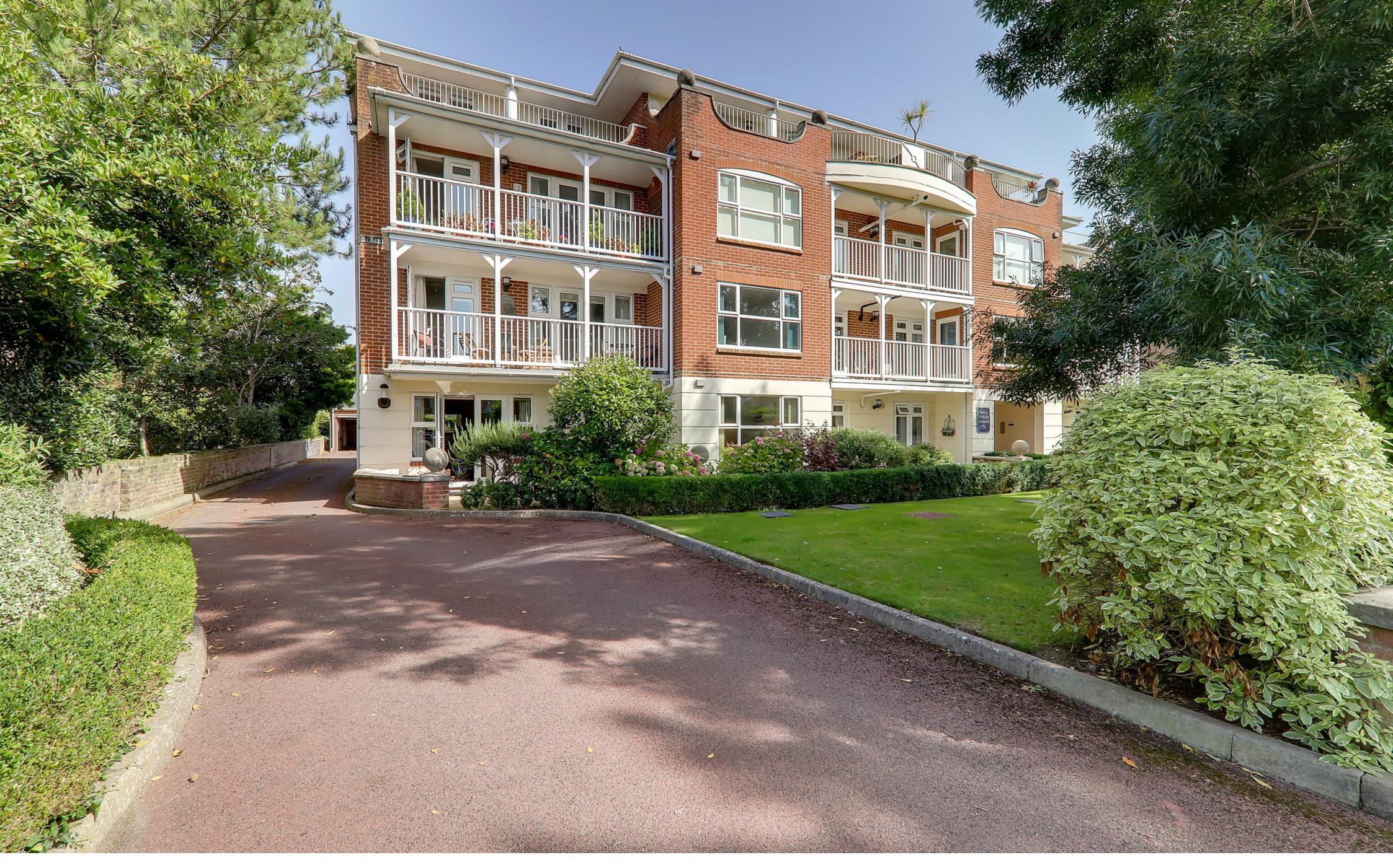
Flat 4 Mill Field Lodge, Worthing, BN11 4AB Price £525,000