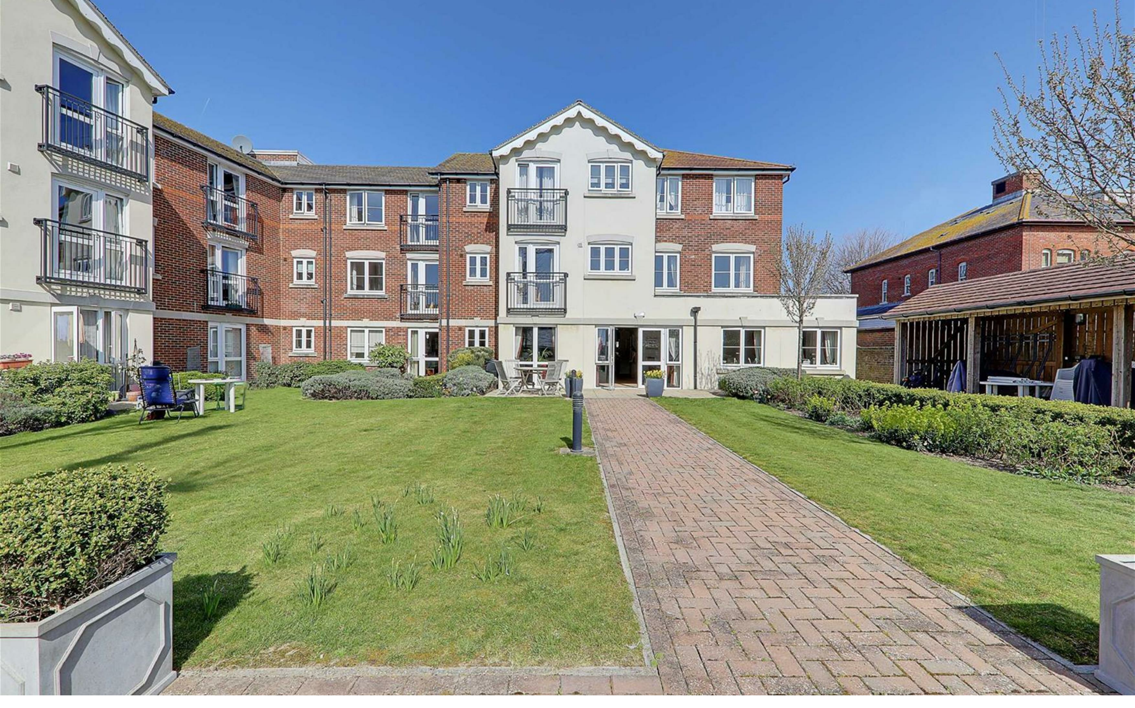
28 Cambridge Lodge, Southey Road, Worthing, BN11 3HT Guide Price £170,000