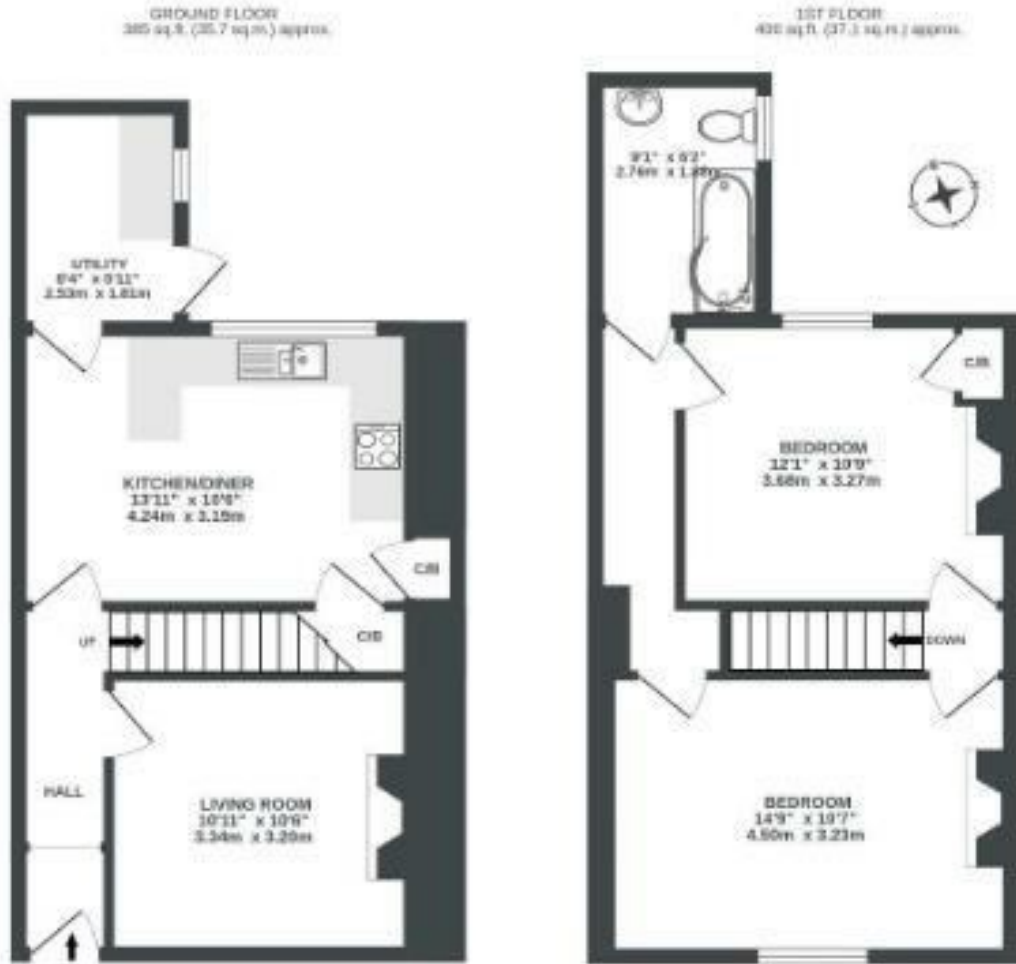
Illustrations are for reference purposes only, measurements are approximate, not to scale.