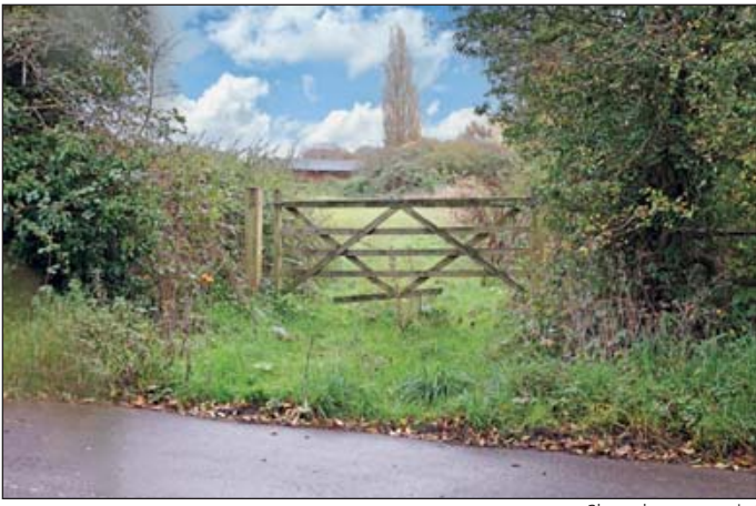
Shared access point

Each plot comprises a parcel of land which form part of a larger area previously utilised for grazing. Access to the plots will be via a gated right of way (not physically made up) however, prospective purchasers may wish to investigate the possibility of direct access being created to Alms Heath road subject to all necessary consents. The plots are sold as is on an unconditional basis only but subject to a planning overage provision full details of which are available in the legal pack. Prospective buyers considering alternative use and/or development prospects are deemed to rely solely on their own planning and other enquiries prior to bidding.