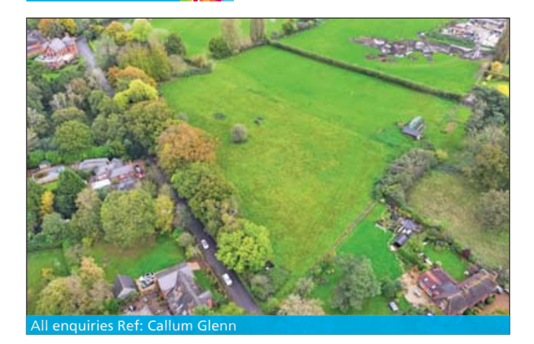
TO BE SOLD AS INDIVIDUAL LOTS