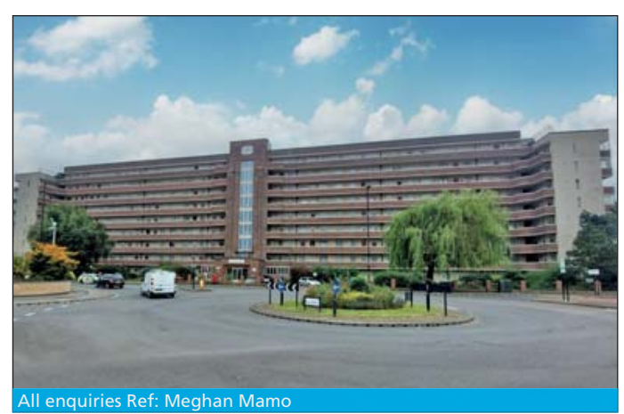
Leasehold first floor flat