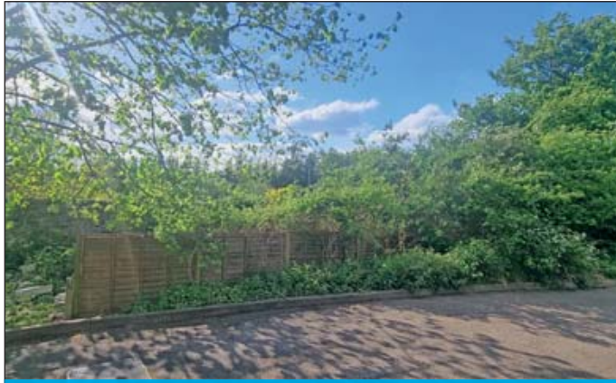
All enquiries Ref: Callum Glenn