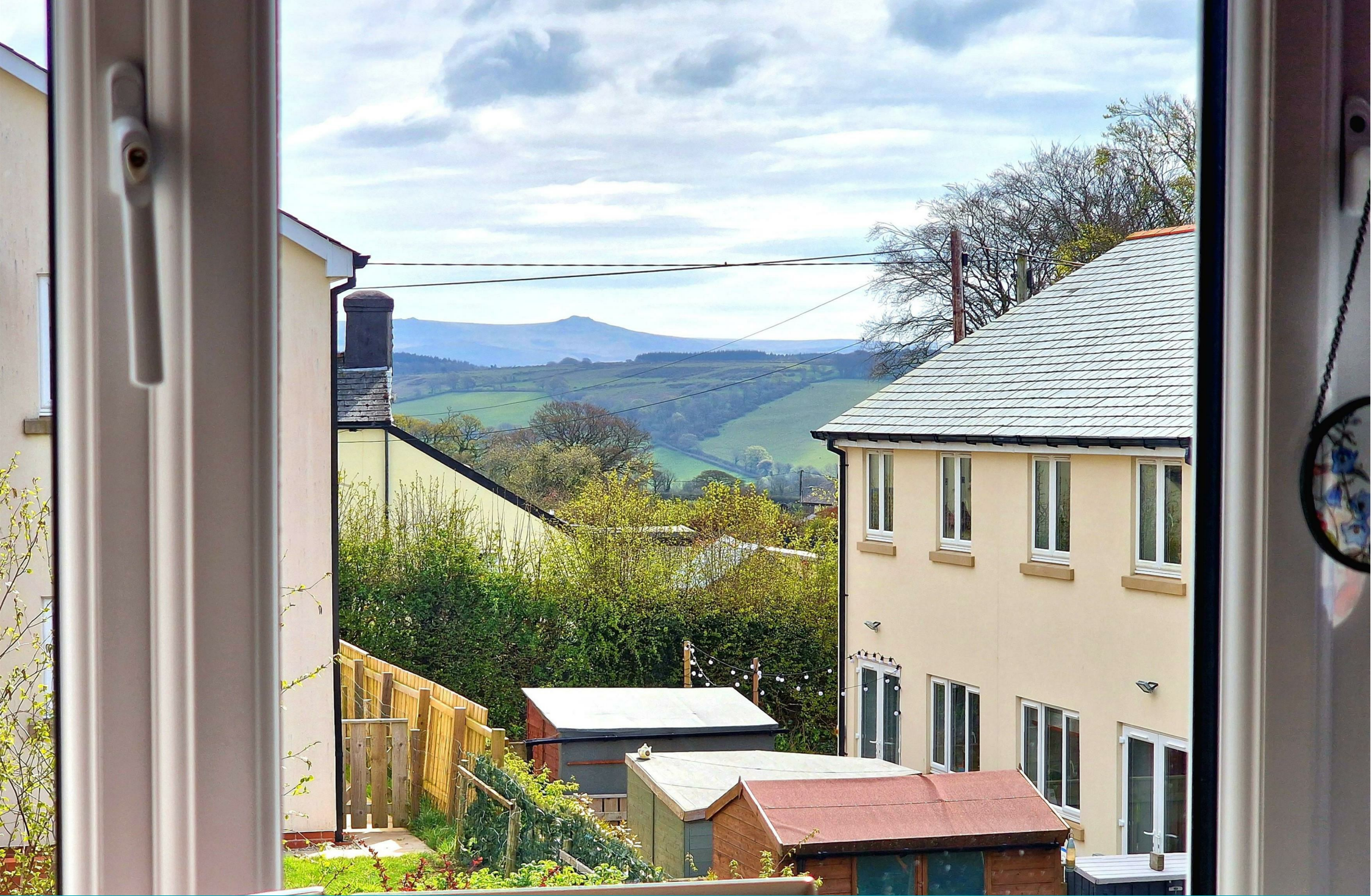
Schoolhayes, Lewdown, Okehampton, EX20 4FF