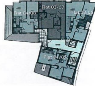
Typical First and Second floor plan