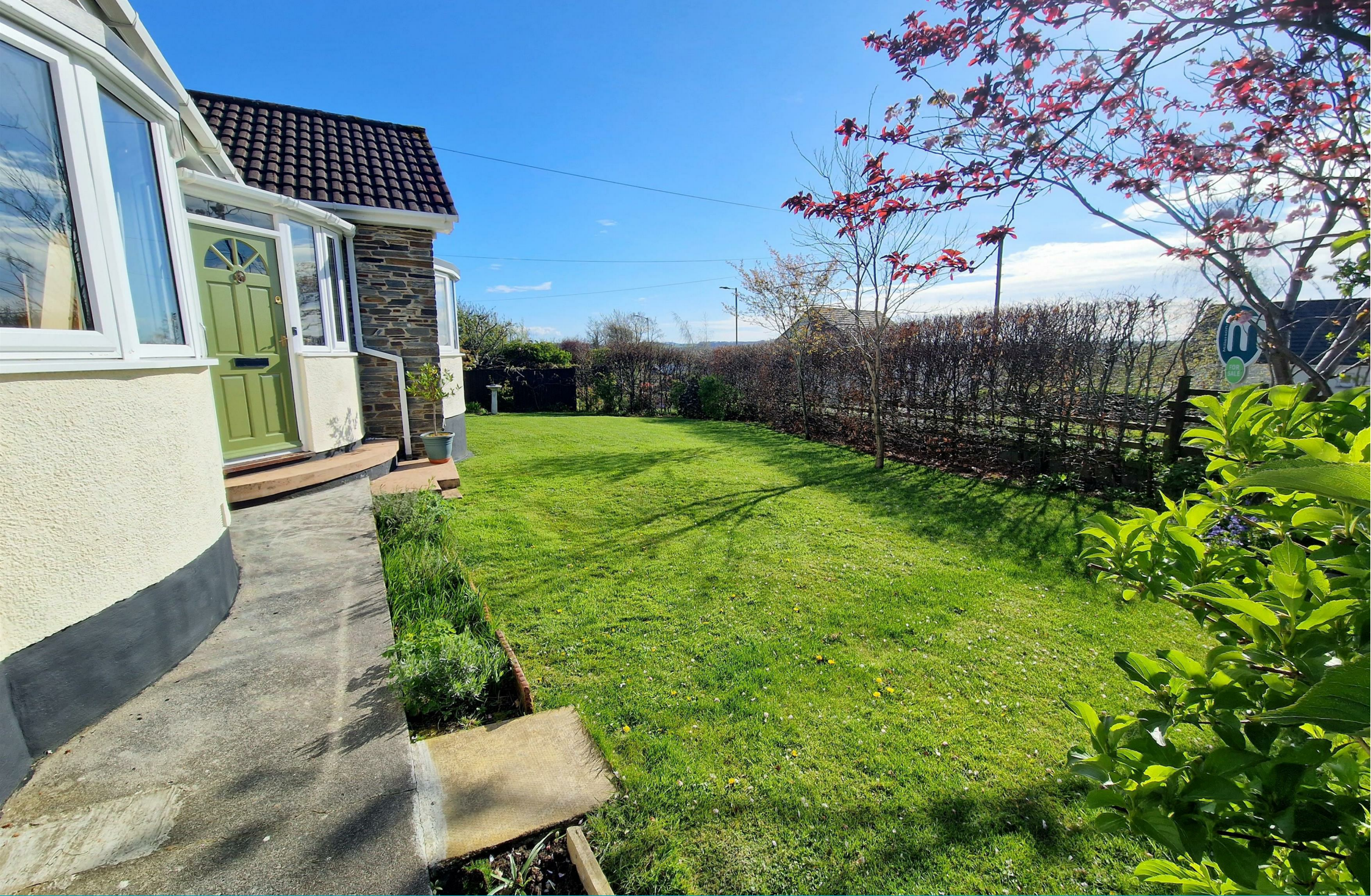
St. Giles-On-The-Heath, Launceston, PL15 9SD